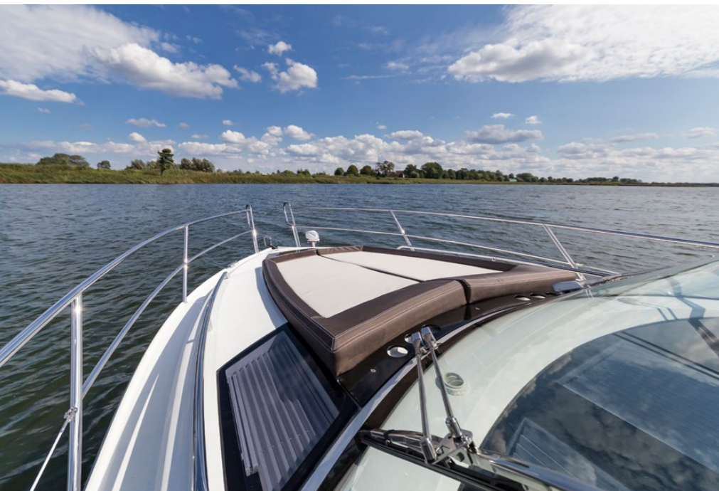
— Bow sundeck area