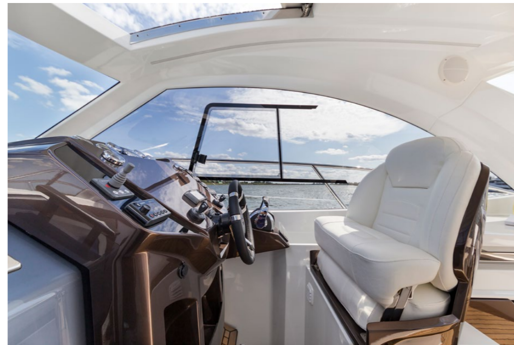
— Bolstered sport seat for extra support