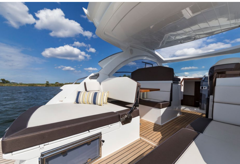
— Aft seating can be converted into a sunpad