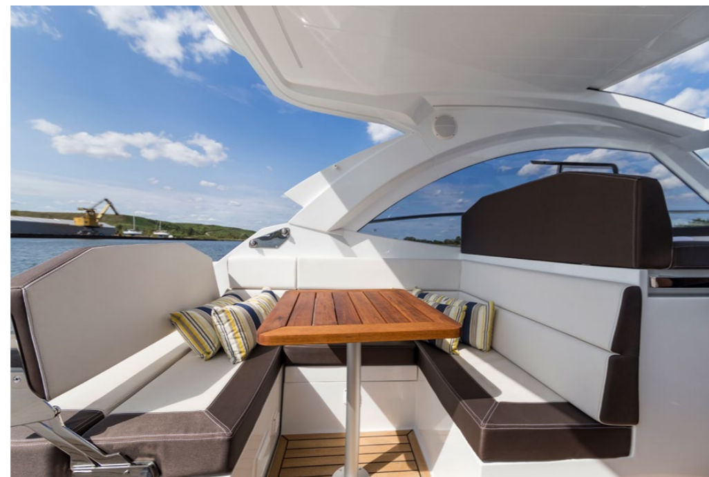
— Pop-up table for al fresco dining