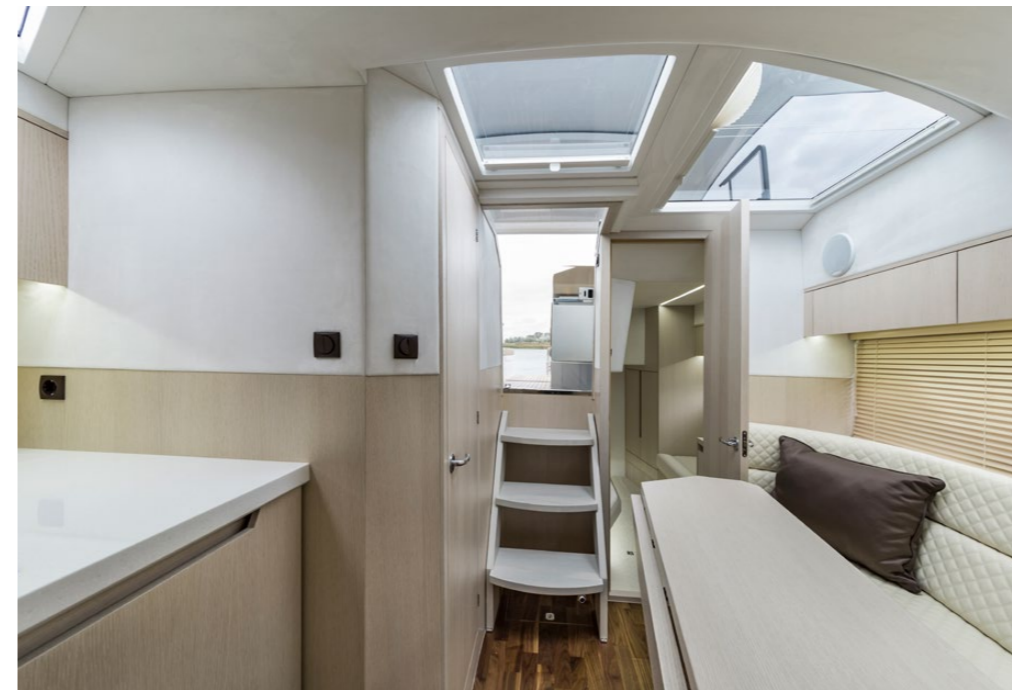
Extend the table for extra dining space