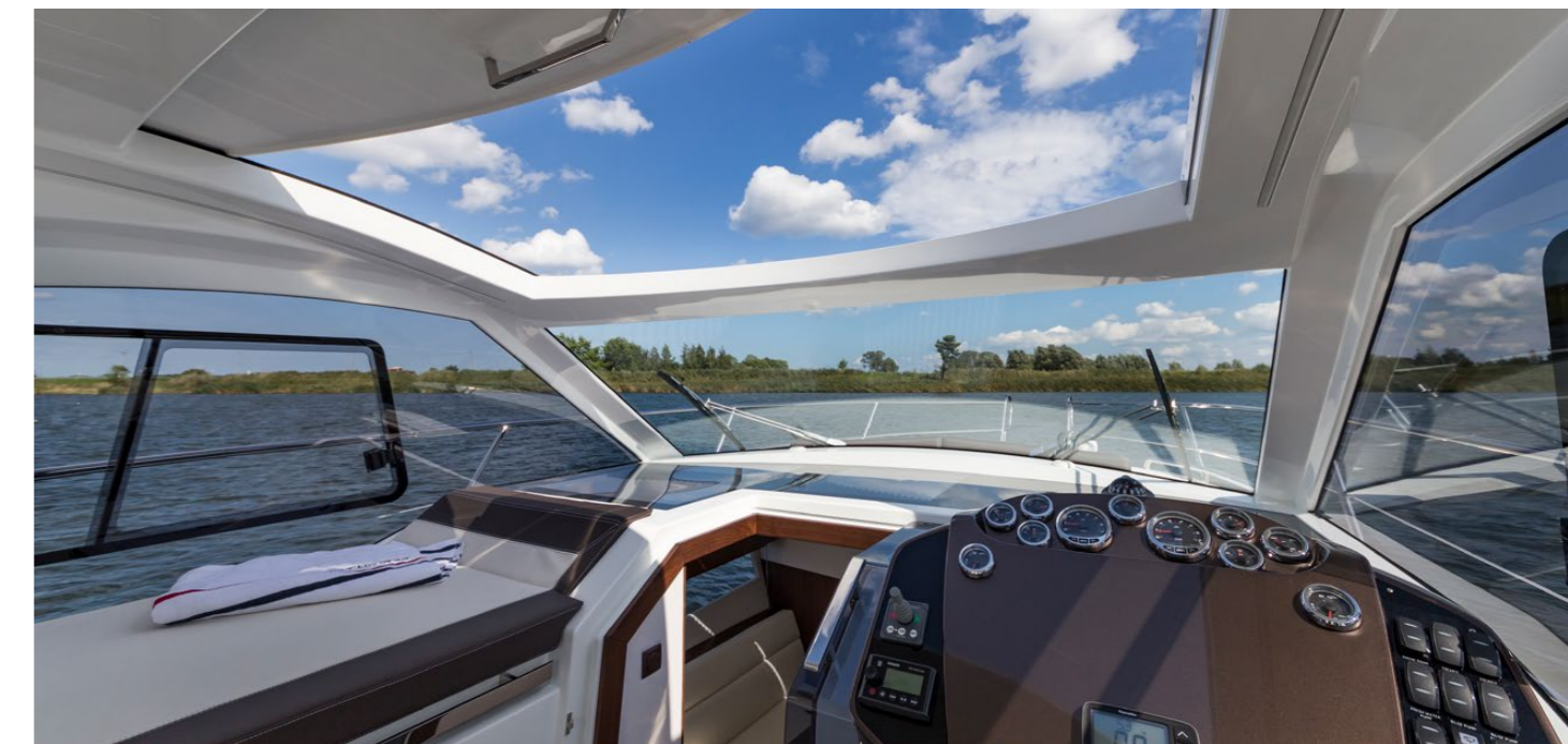
Helm station offers perfect visibility all around —