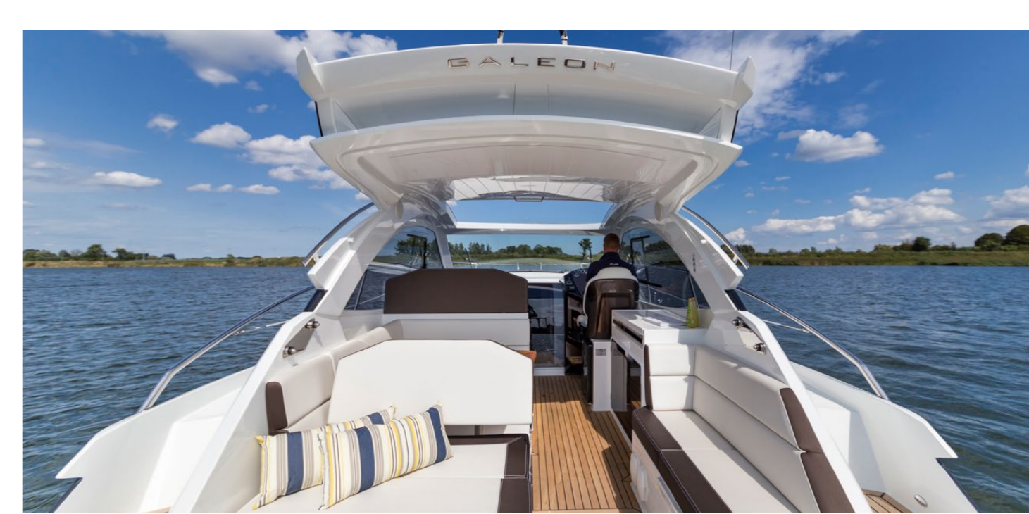
Ample cockpit space for day cruising —

Experience elevated agility and embrace dynamic thrills with the Galeon 335