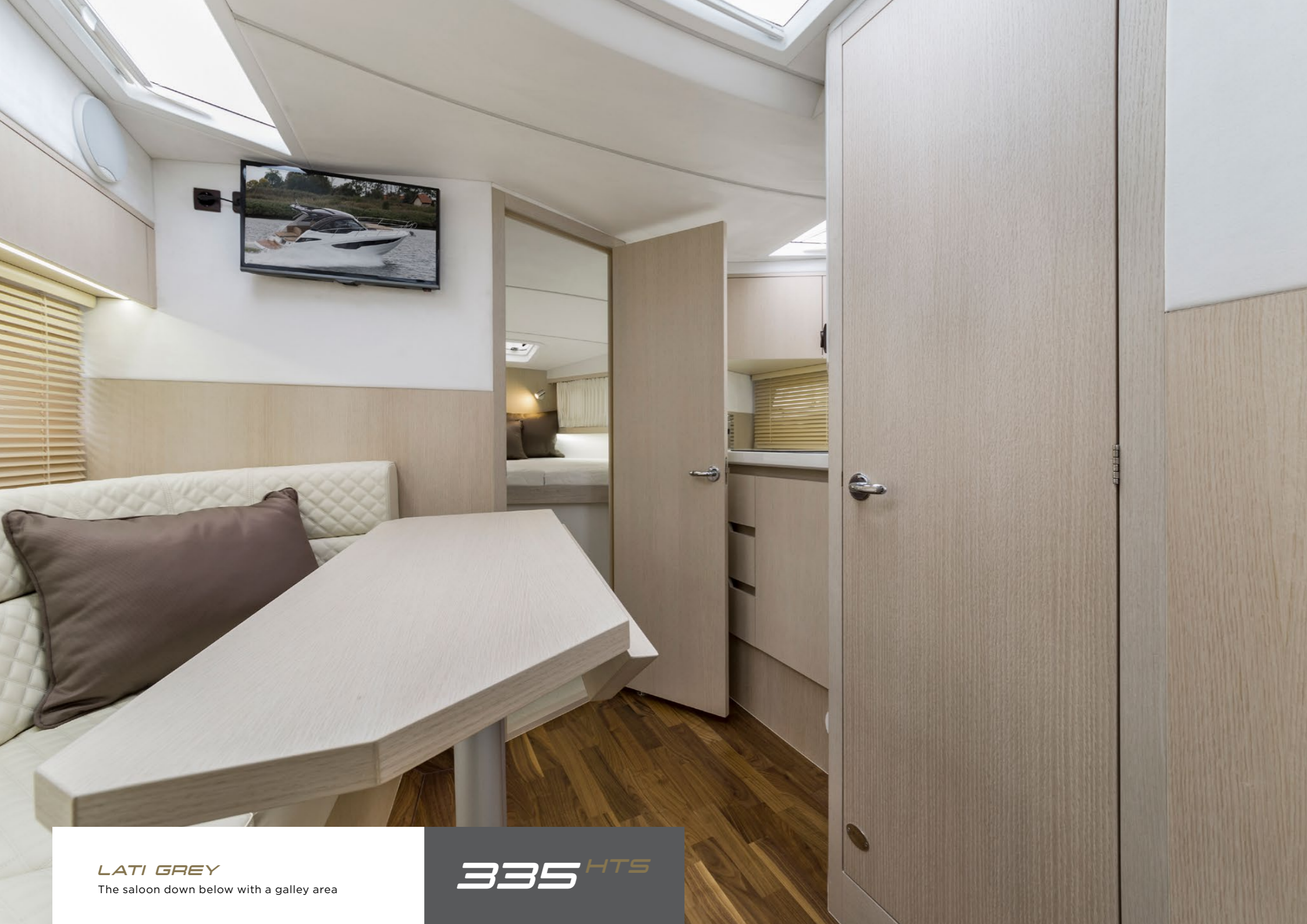
LATI GREY The saloon down below with a galley area