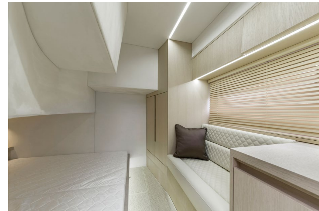
Owner's cabin offers a full sized double bed