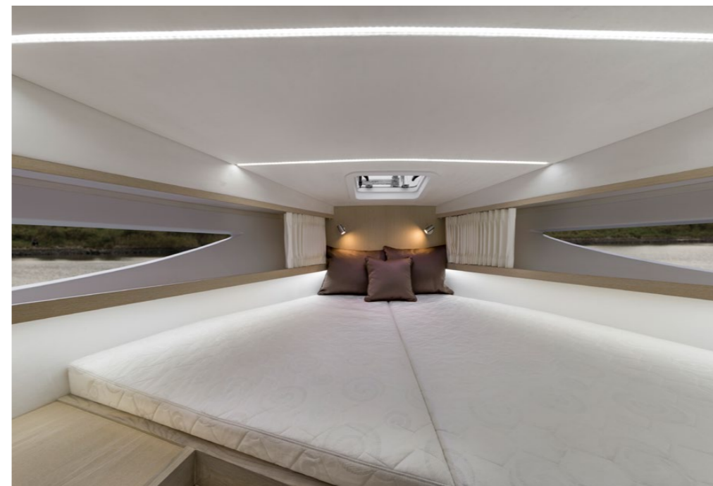
Forward VIP cabin is bright and inviting