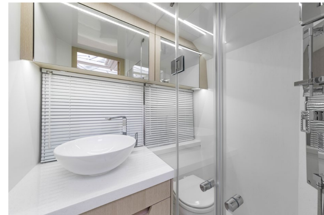
Bathroom holds a separate shower cabin