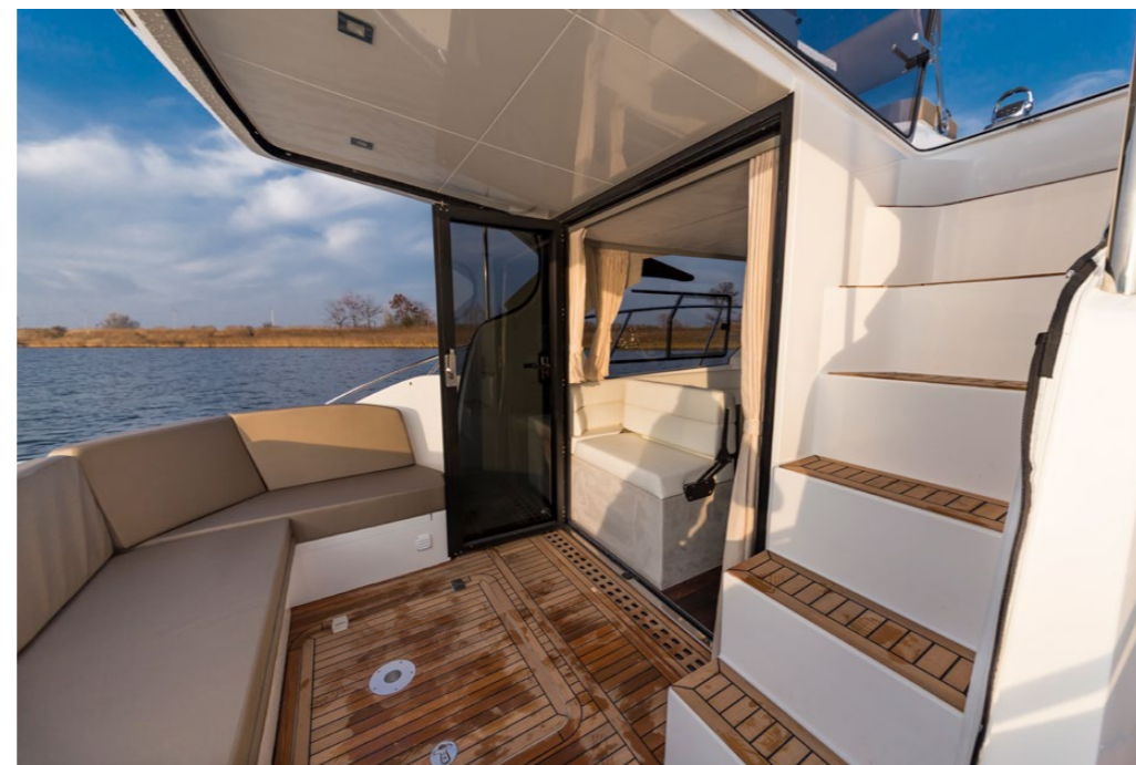
— Slide the glass doors to extend the cockpit area