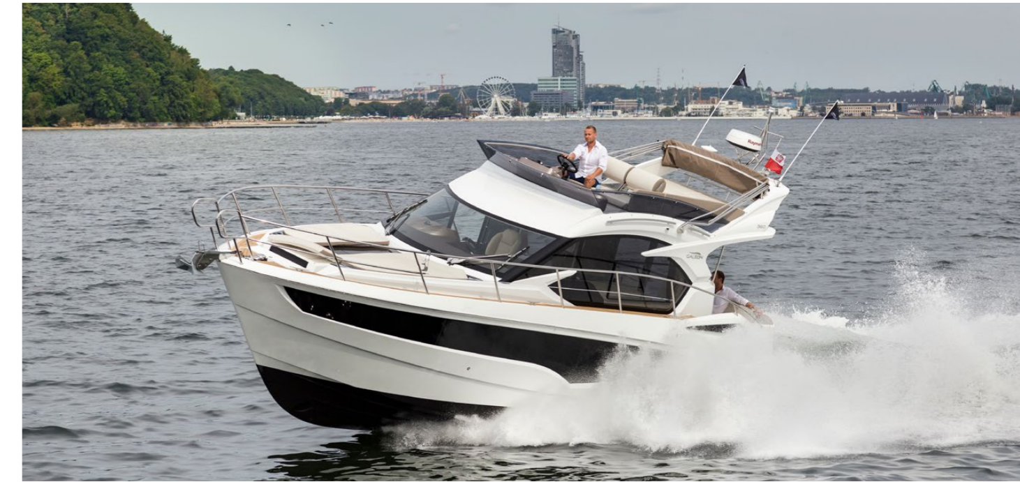
The optional soft bimini offers extra protection from the elements

Perfect proportions, dynamic handling, and stylish design highlight the 360 FLY