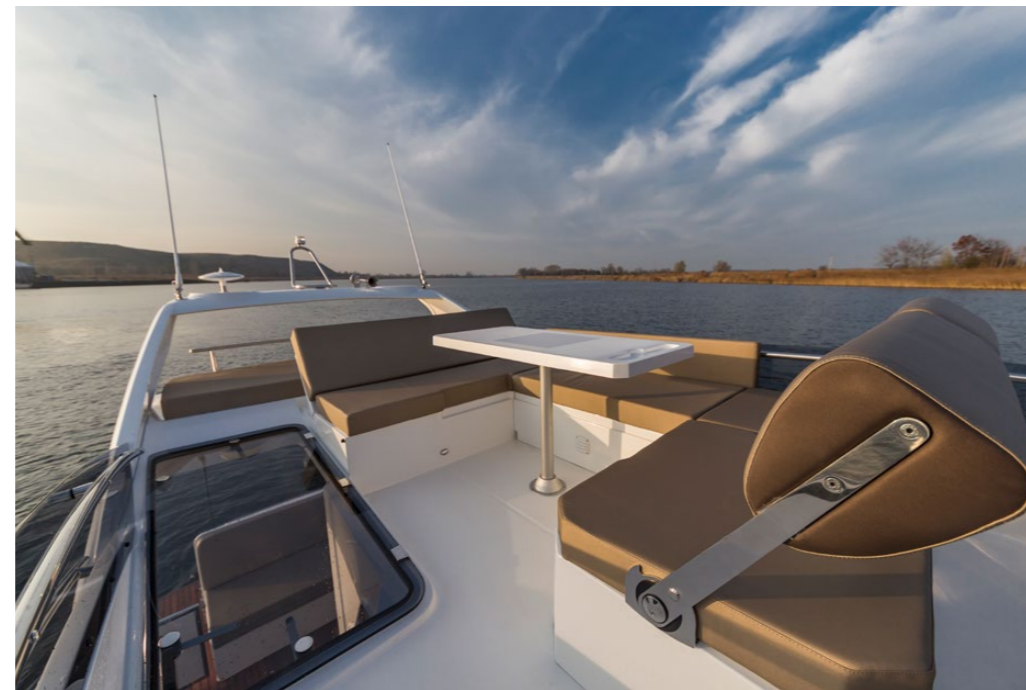
— Tilt the seating for al fresco dining up top