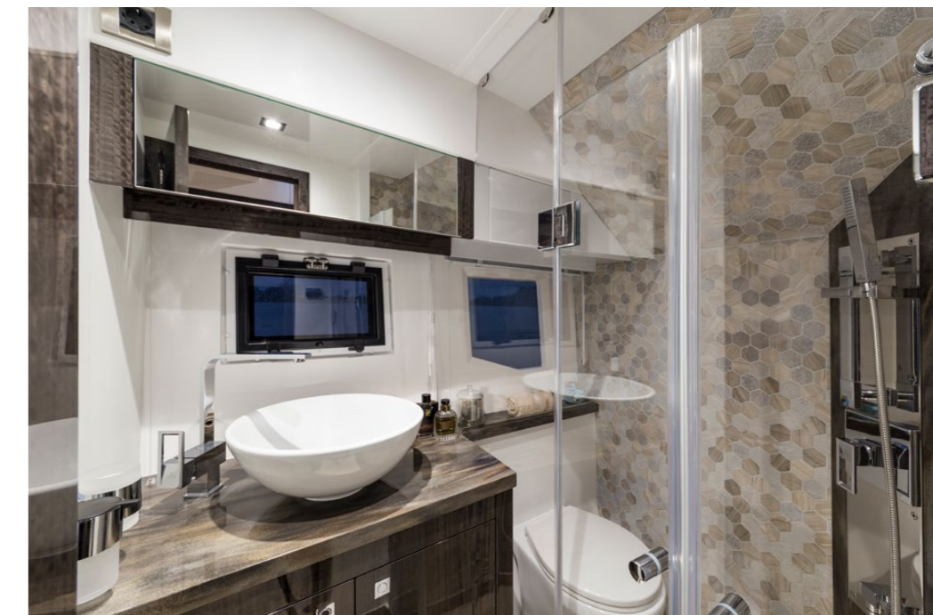
Bathroom with a separate shower area —