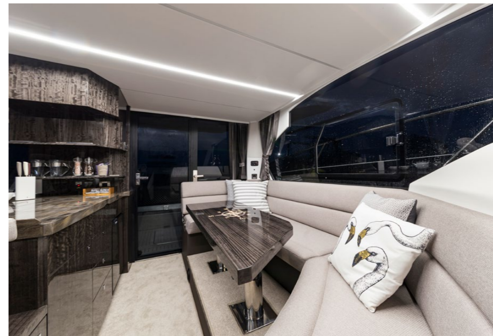
Dining and rest area —