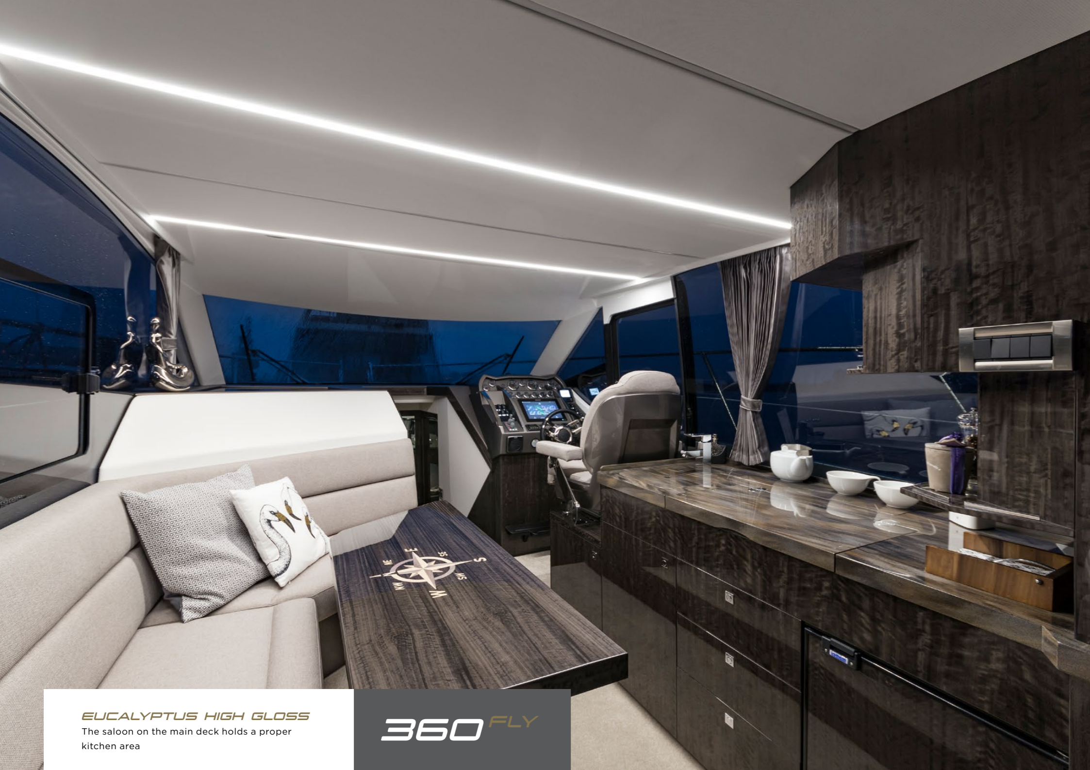
EUCALYPTUS HIGH GLOSS The saloon on the main deck holds a proper kitchen area