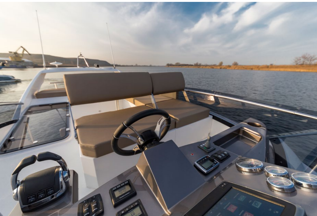
— Top deck helm station for perfect visibility