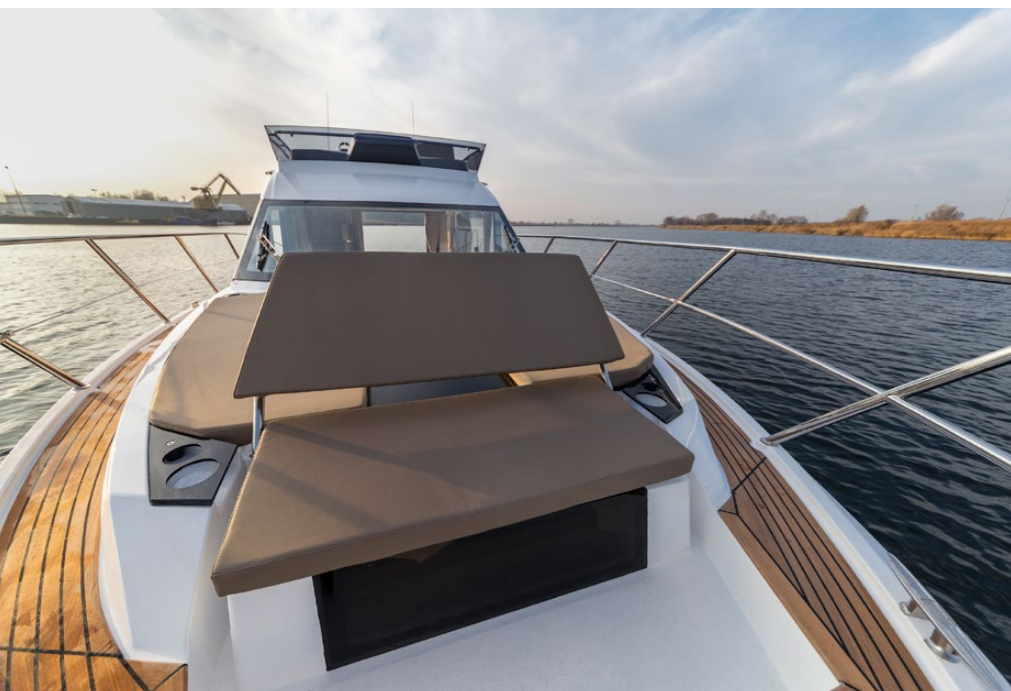
— Bow area with a pop-up seat up front