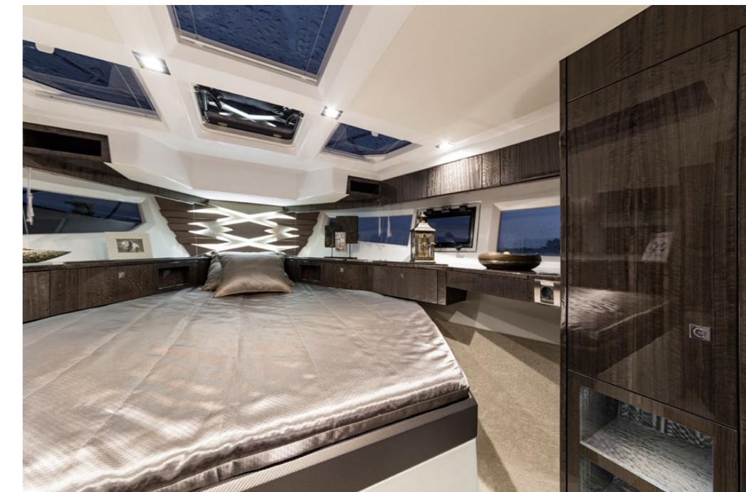
Bow VIP cabin is brightened by skylights —