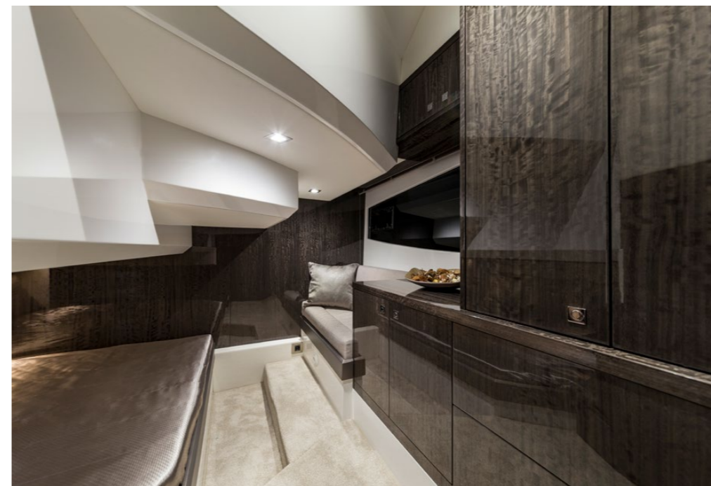
Midship cabin with a large, double bed —