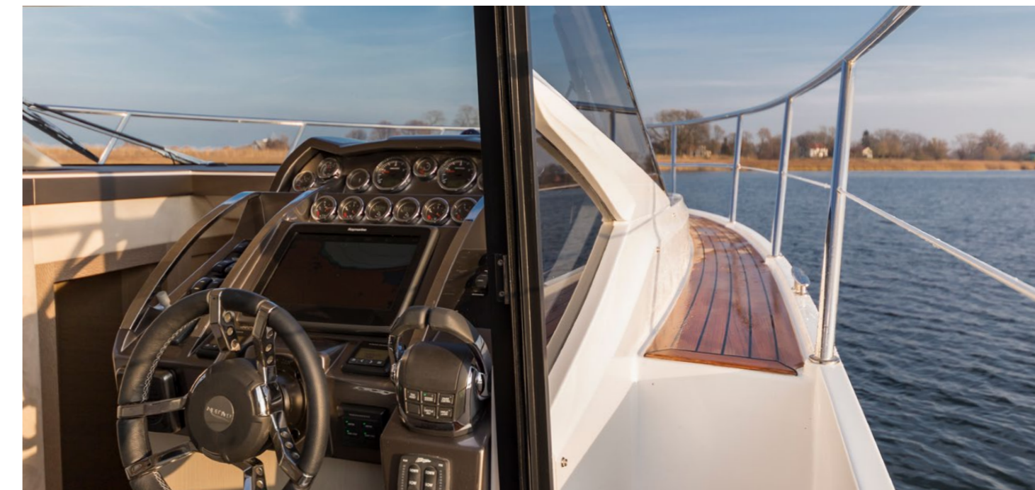
Sliding side doors for easy bow access