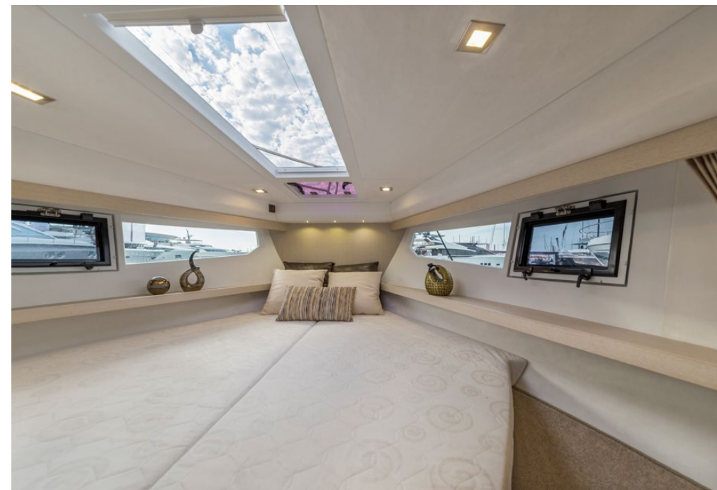
Forward VIP cabin with a magnificent skylight —