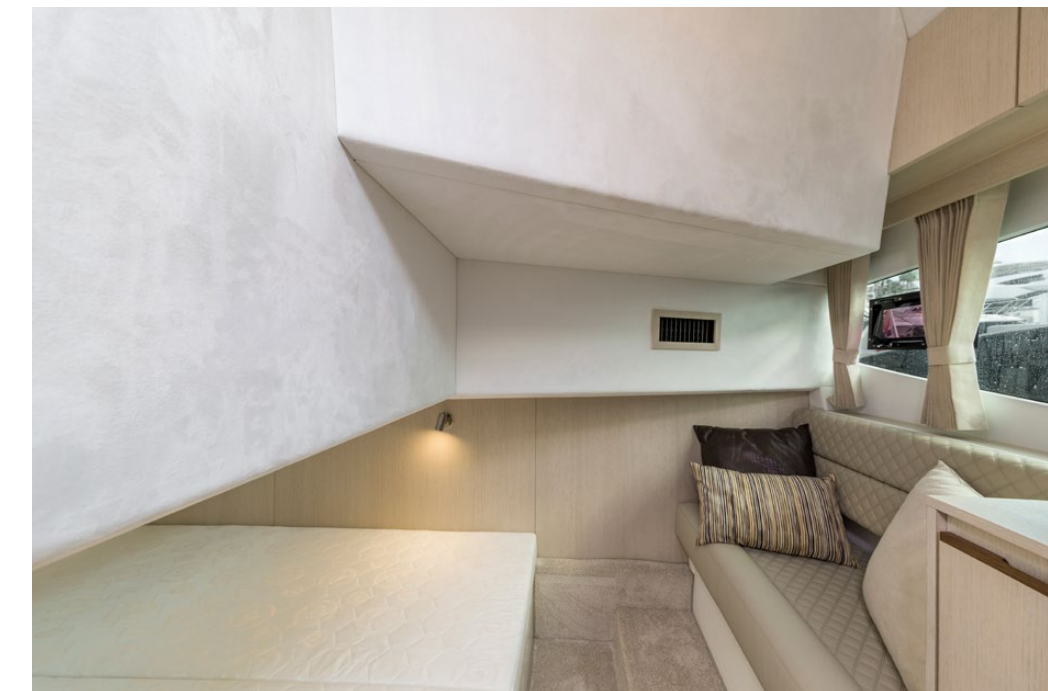
Double bed and a rest area in the guest cabin —