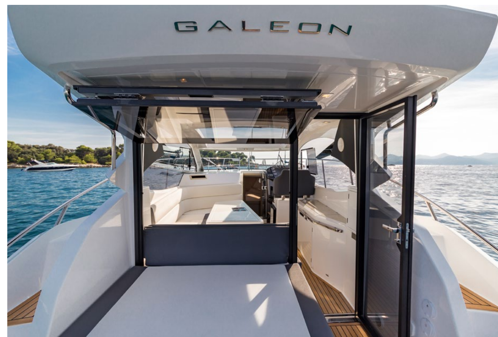
— Open or closed cockpit - You decide!