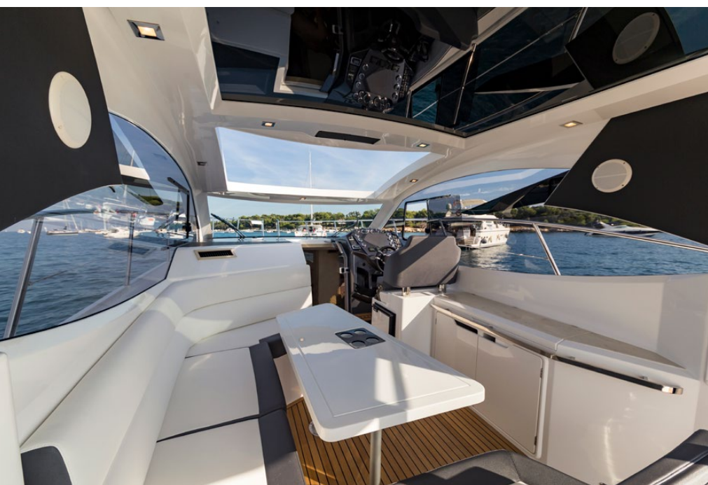
— Wet bar and dining area