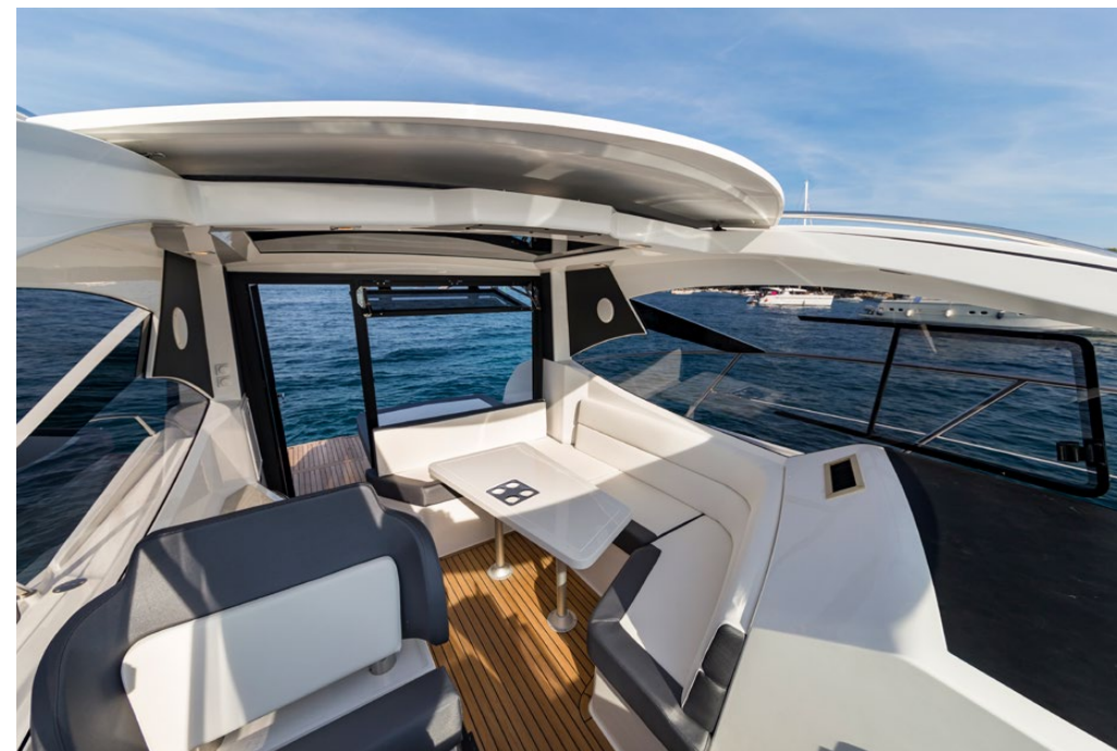
— Great visibility all around