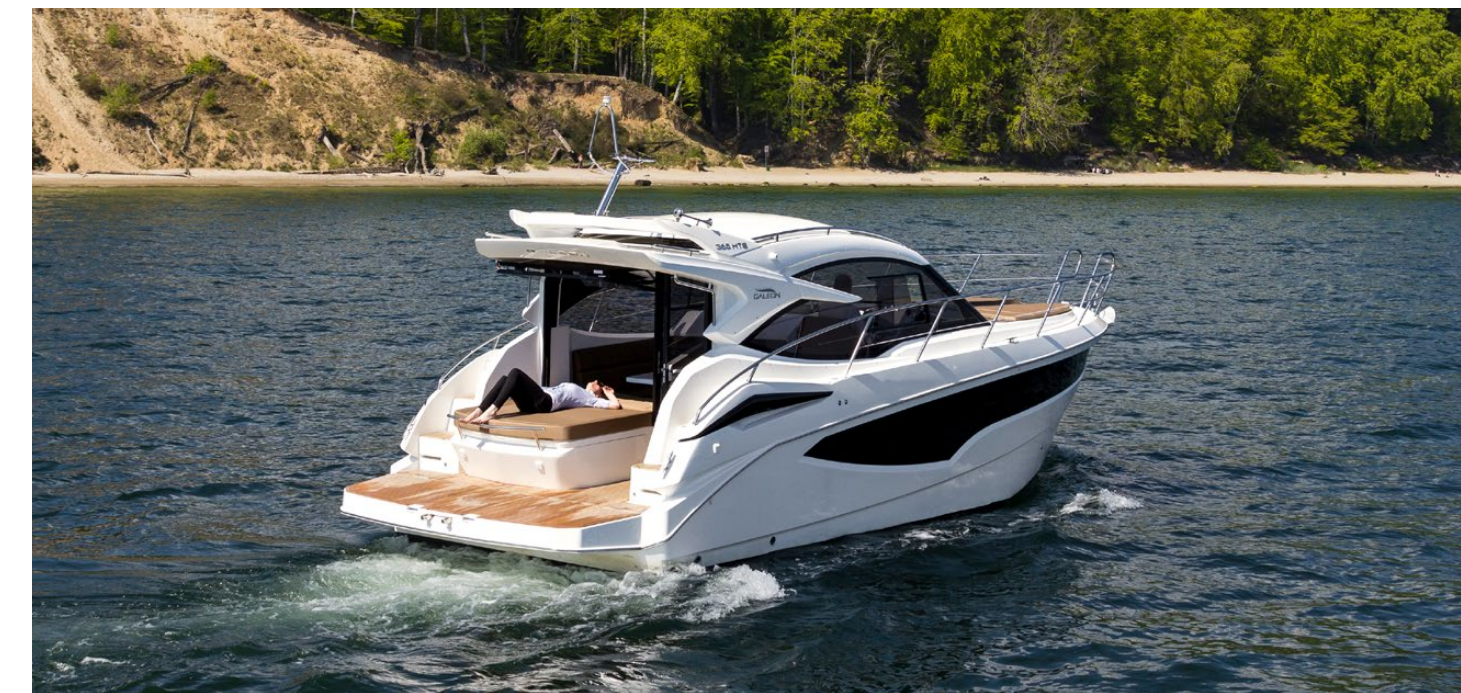
Open the cockpit window and enjoy the sunpad —