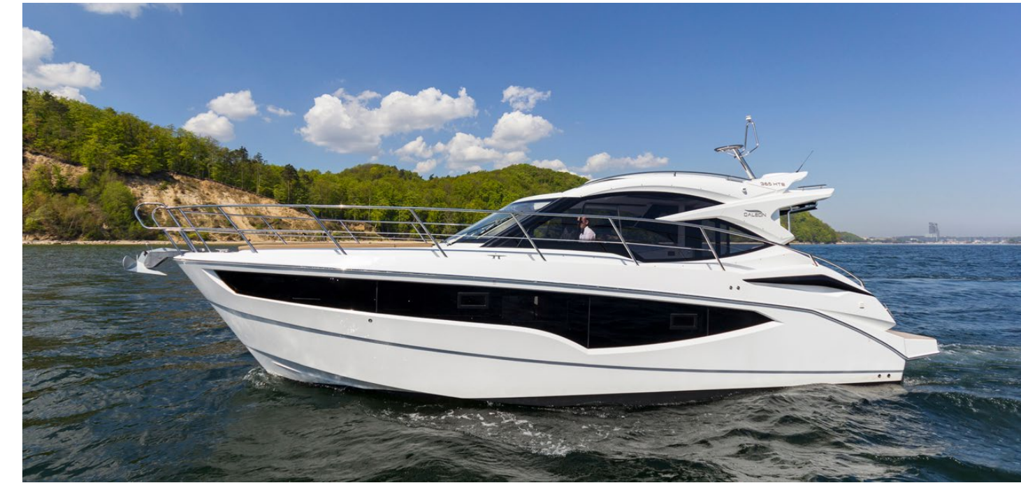
Sleek lines with an abundance of windows —

Seamless maneuvering, athletic styling, and an optimal center of gravity