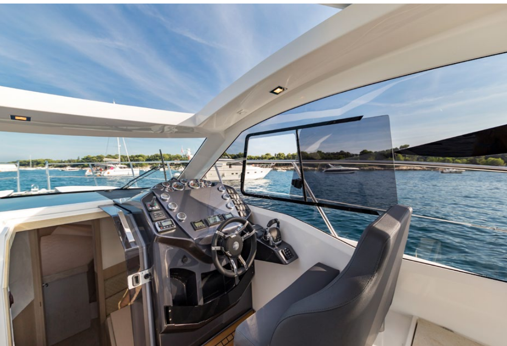
— Ventilate the main deck by opening the sunroof and sliding the window