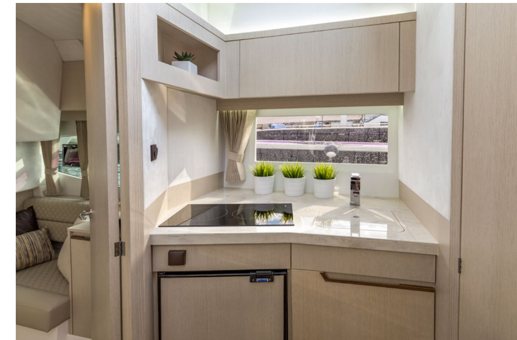
A convenient galley with a fridge —