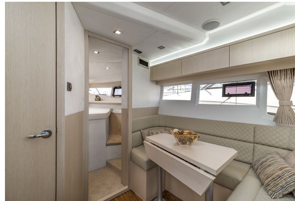
Rest and dining area with a removable table —