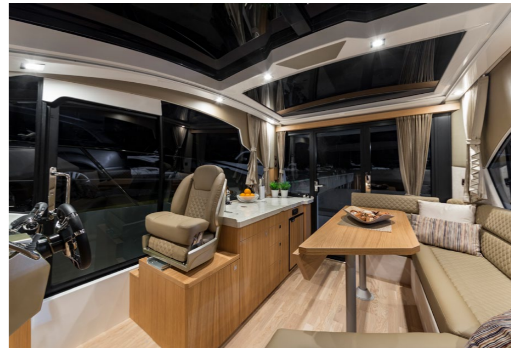
Saloon comes with a dining area and a galley