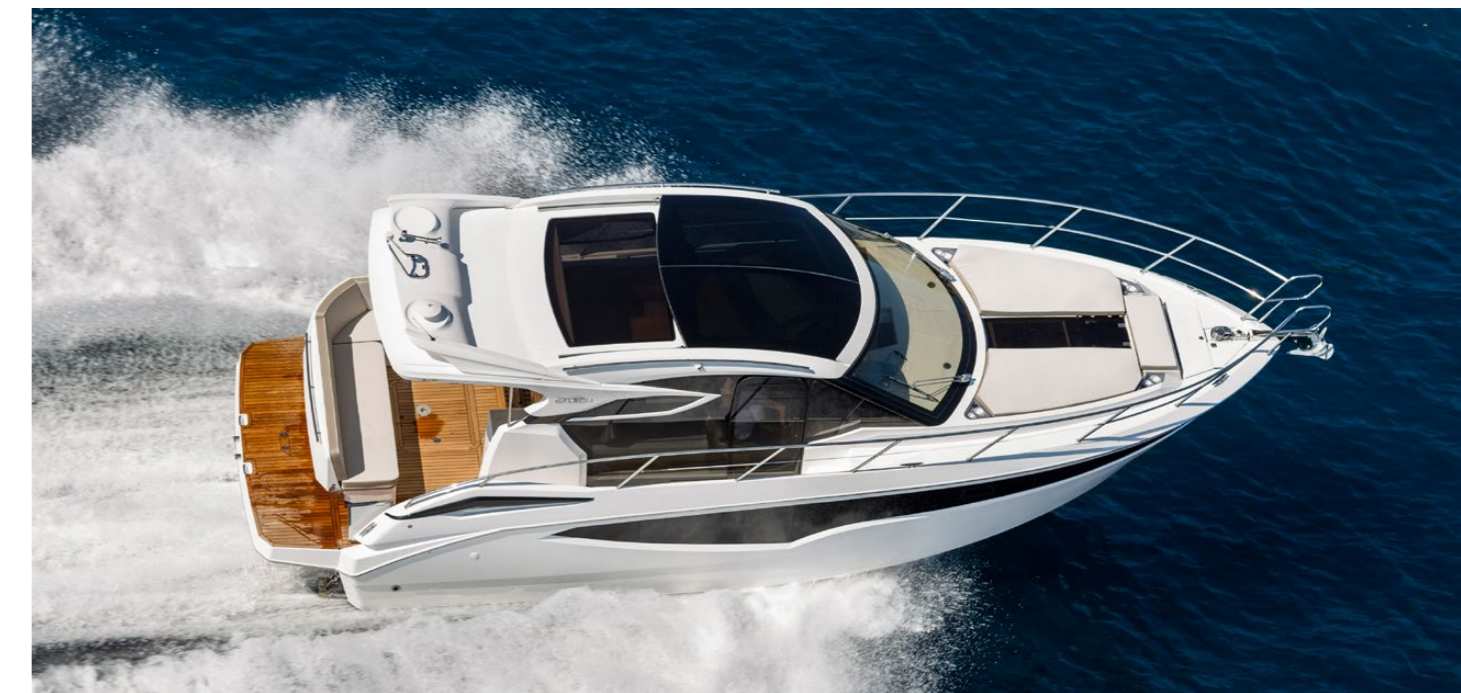
Notice the glass panels extending over the roof —