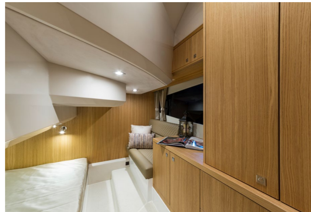
Guest cabin with a double bed and plenty of storage areas