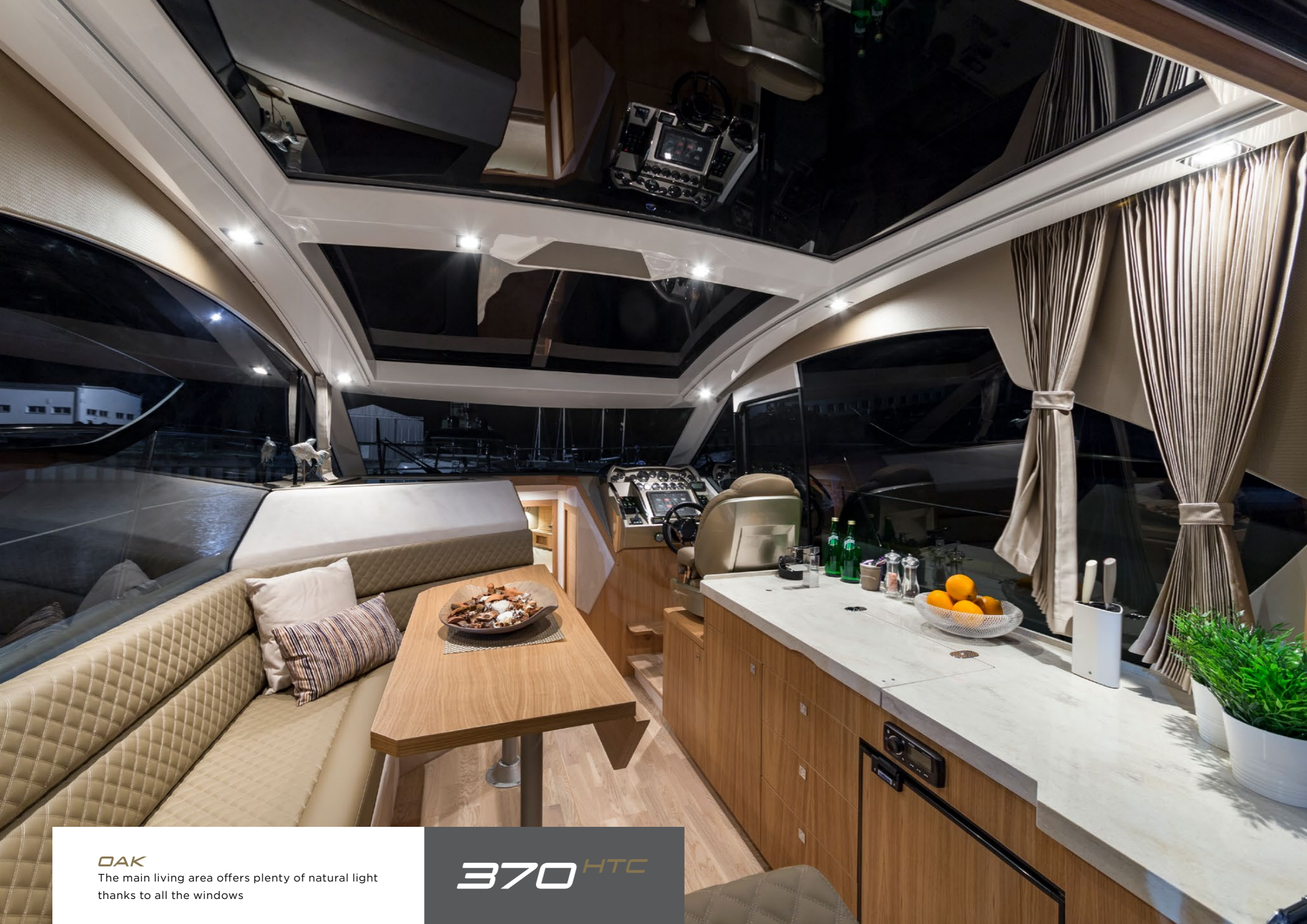
DAK The main living area offers plenty of natural light thanks to all the windows