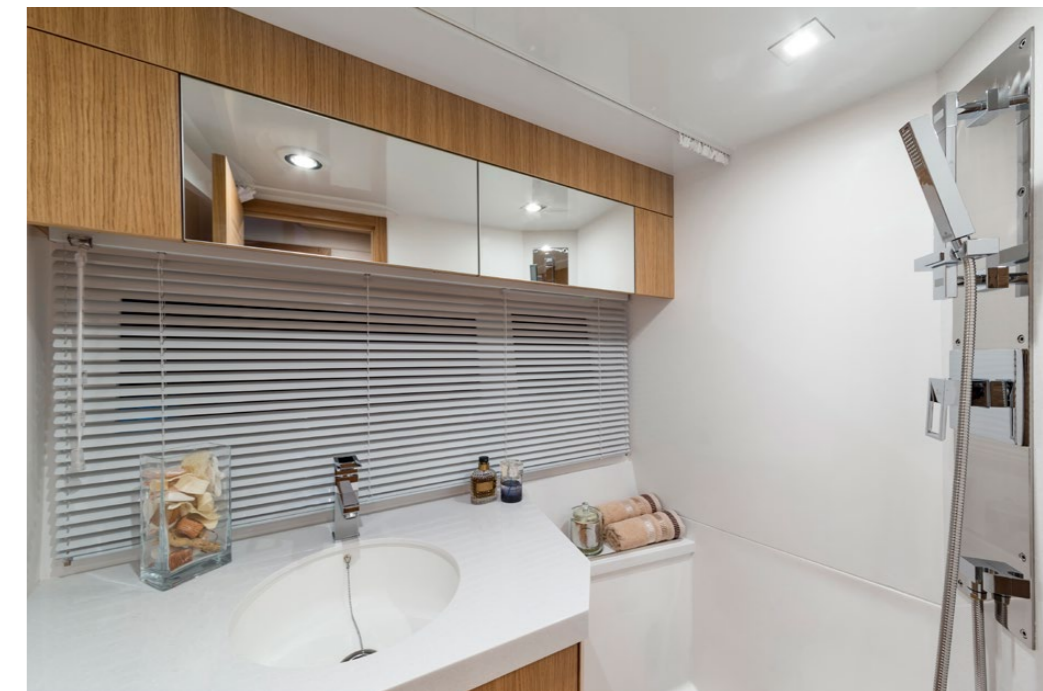
Bathroom is equipped with a head, sink and shower