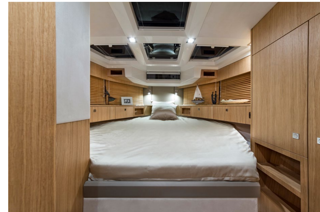
Forward cabin with a double bed is brightened by skylights