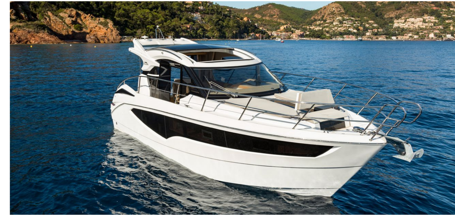
Bow seating for the adventurous —

Ideal balance: proportions, agility, and elegance.