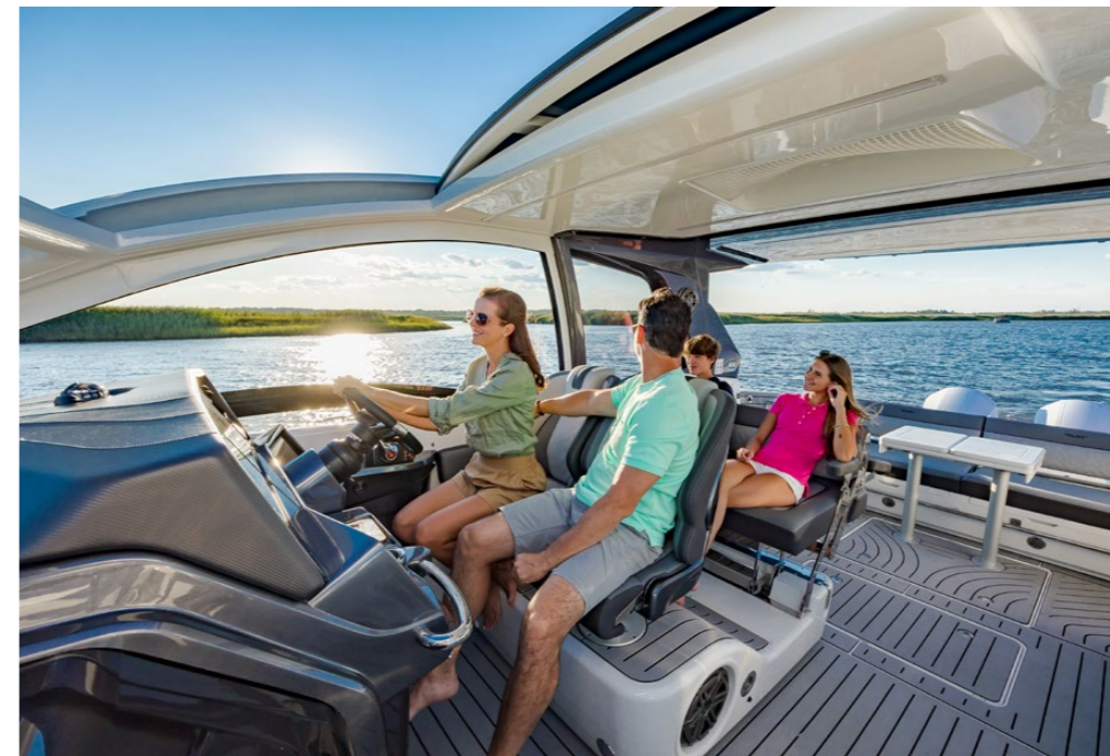
Drop both windows and retract the sunroof automatically