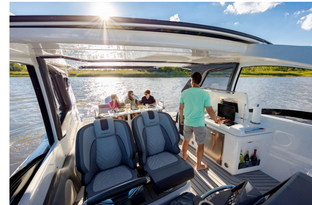
Twin sport seats at the helm