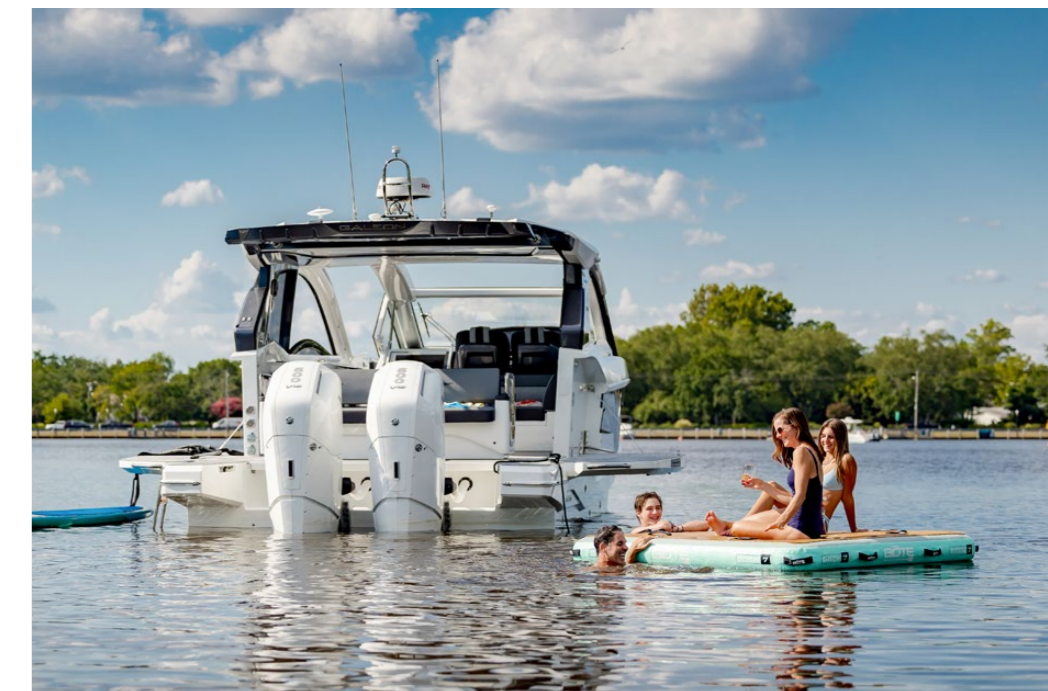
The 375 GTO is ideal for full-day excursions