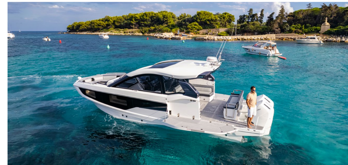
Amazing Beach Mode extends the usable cockpit area —