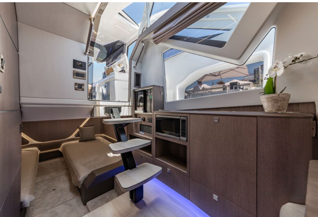
— Saloon, guest cabin and kitchenette down below