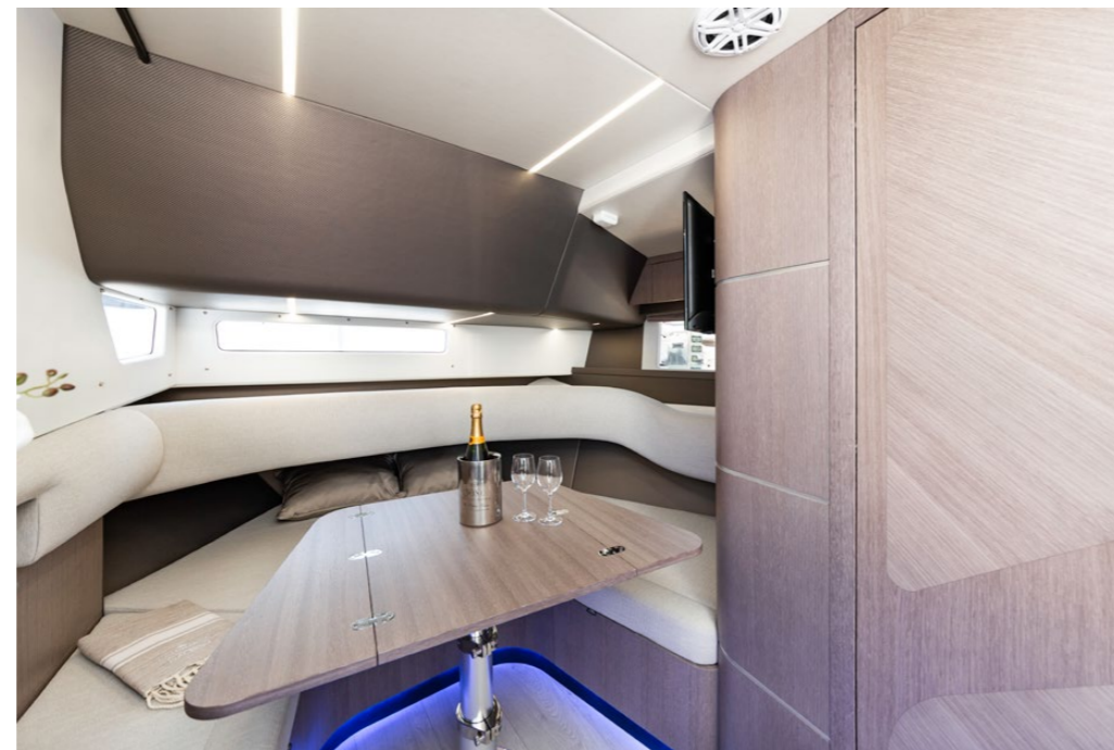
— Bow rest area can be converted into a double bed