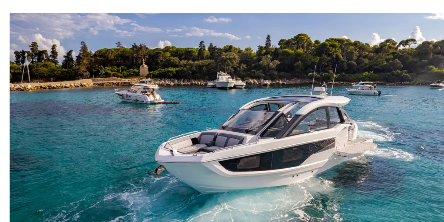
Easy access to the bow area through the tiltable front window —

The perfect day cruiser with abundance of space, innovative design and sporty performance