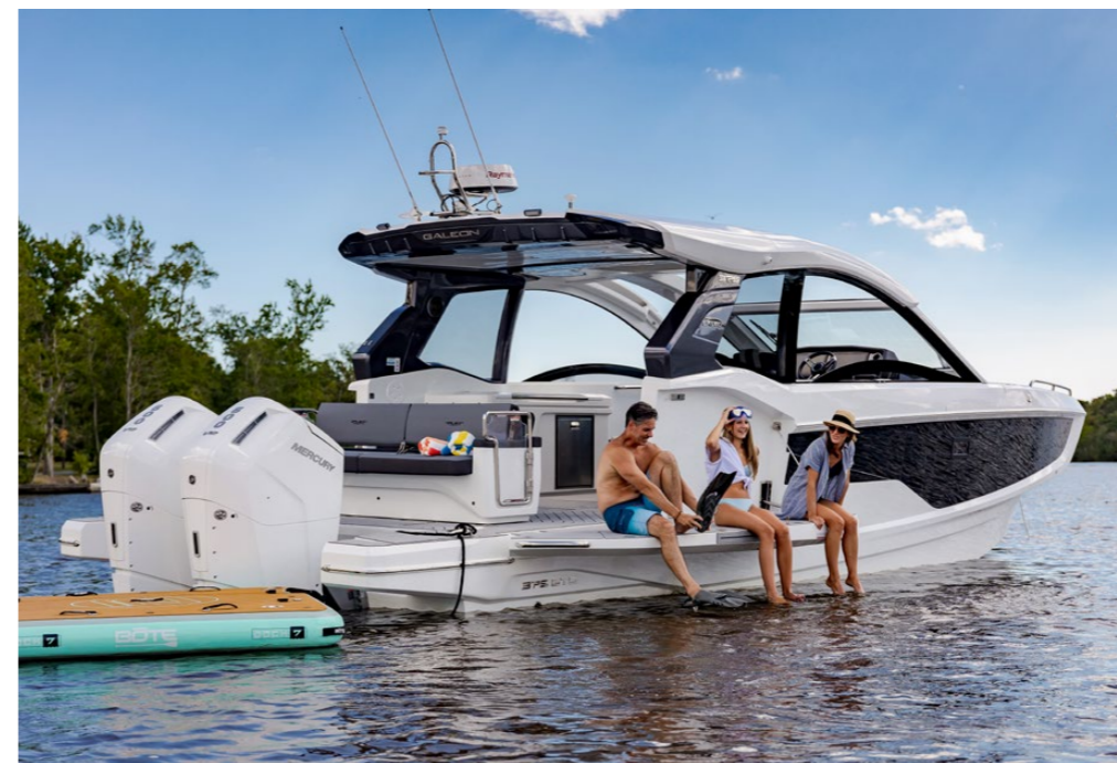
Powerfull V12, 600 HP engines are available