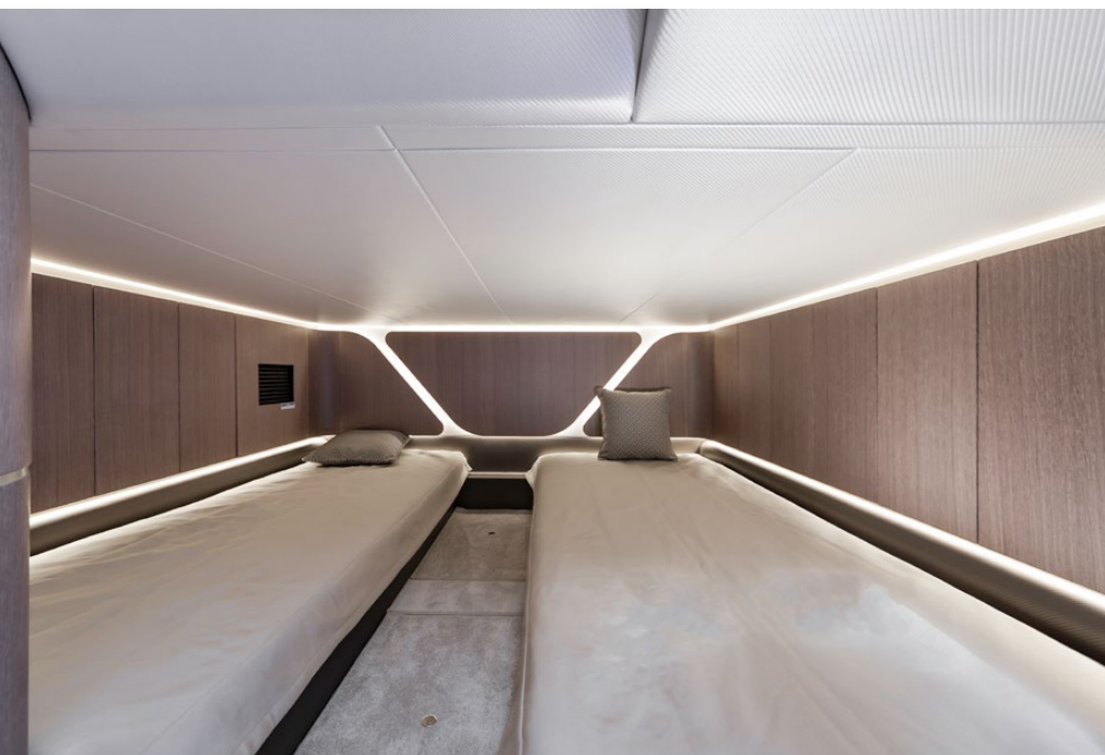
— Twin berths in the guest cabin