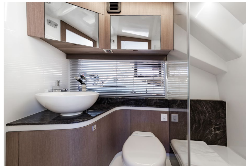
— Bathroom complete with head and shower