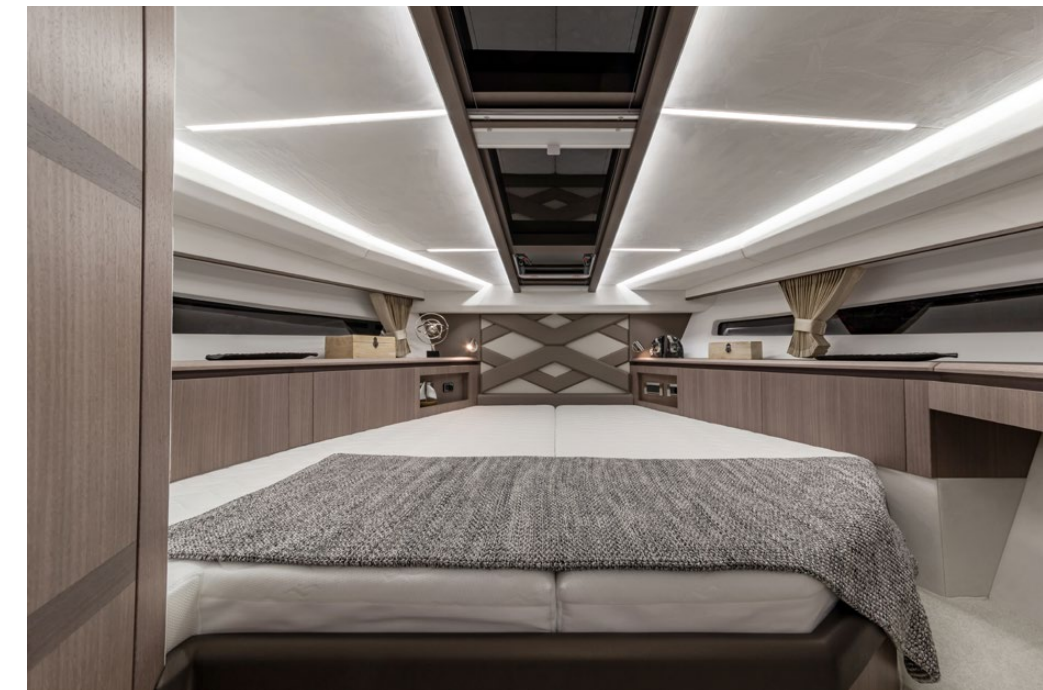
Bow VIP cabin with skylights above