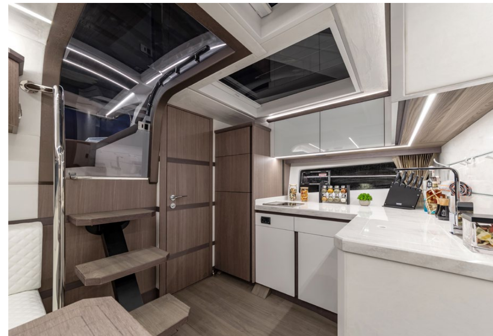
A well appointed kitchen for meal preparation