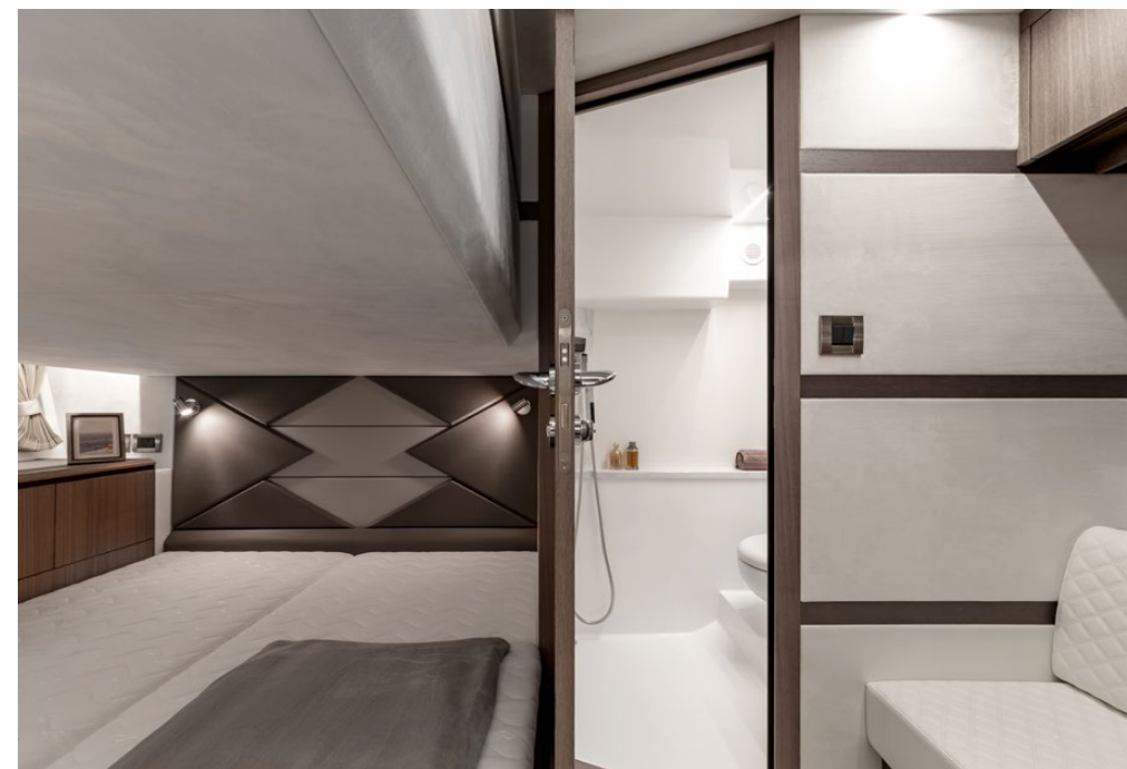
Midship cabin holds a double bed