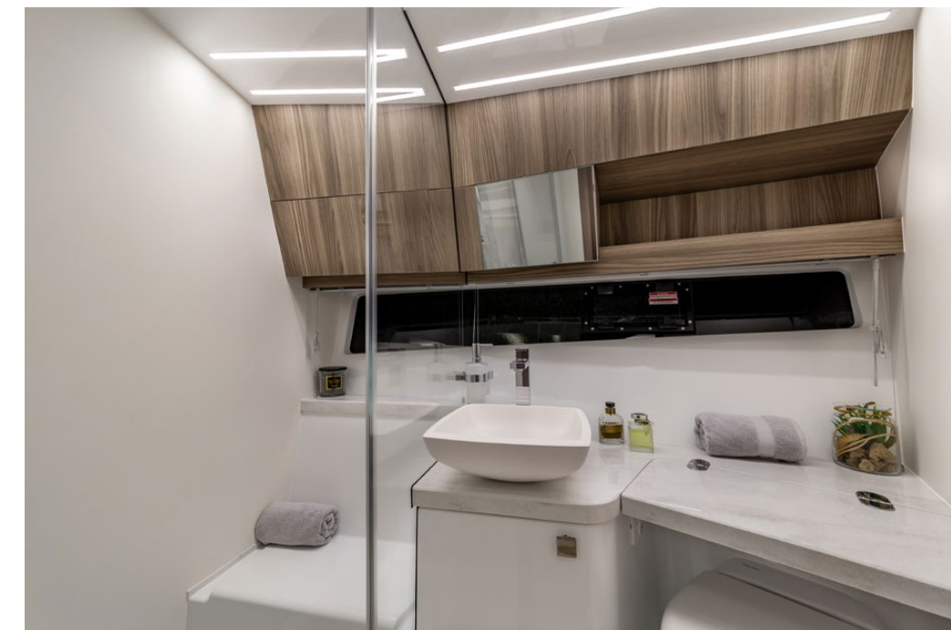
Both guest cabins offer private bathrooms