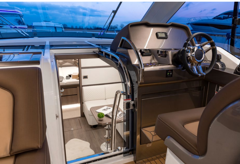
— Easy access to the lower deck