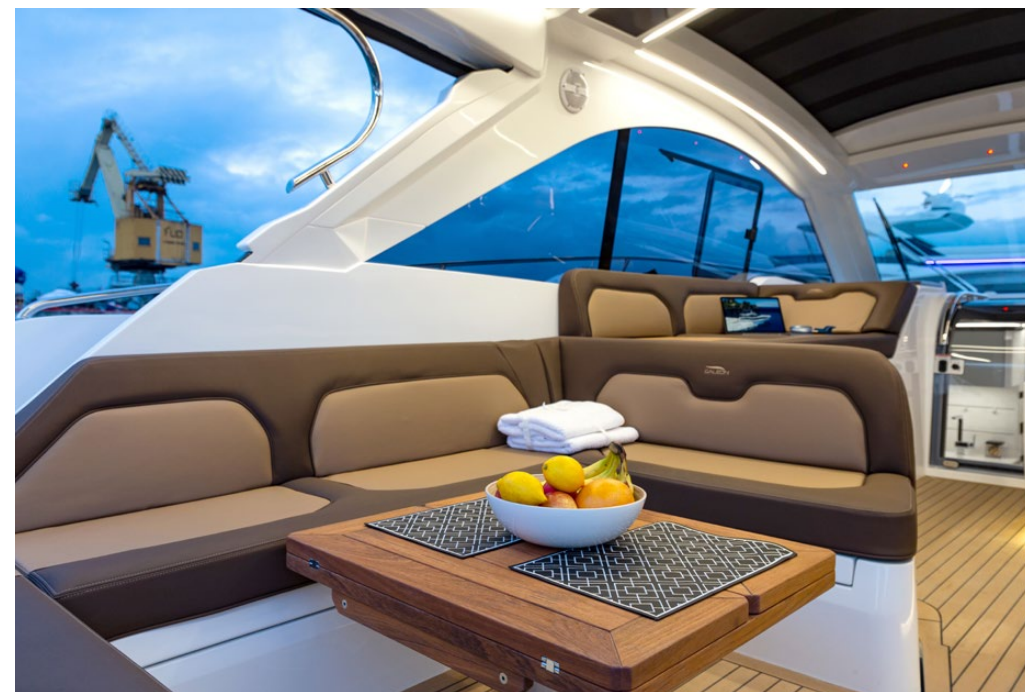
— All fresco dining area