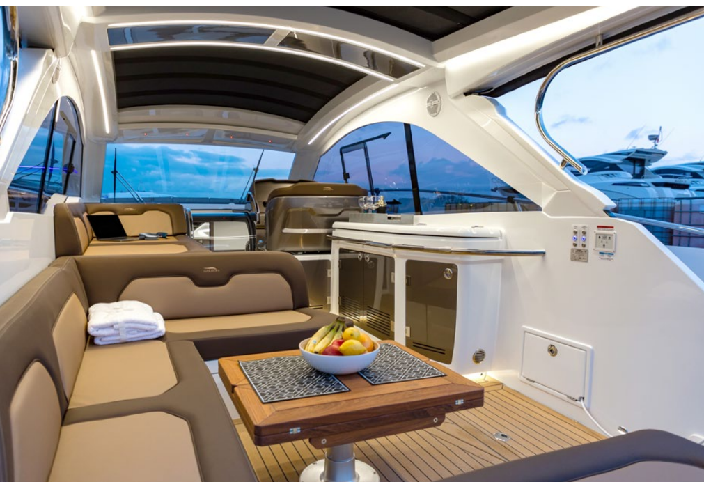
— The wet galley is located in the cockpit