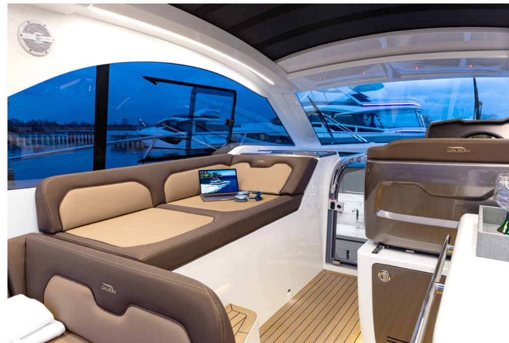
— Rest area opposite the helm station