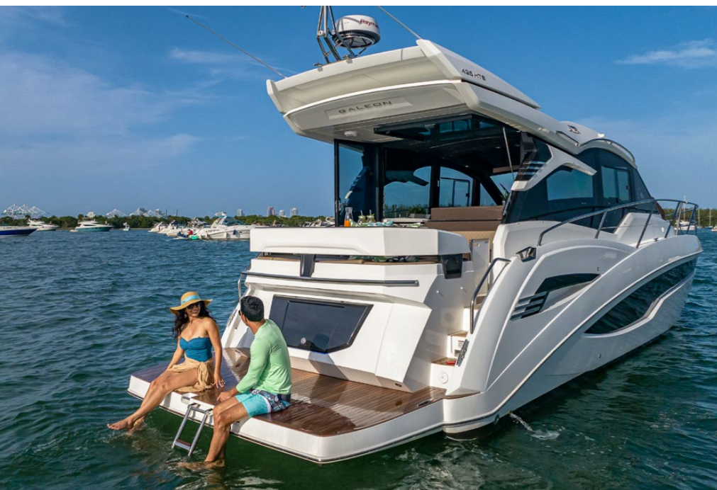
— Bath platform for easy water access