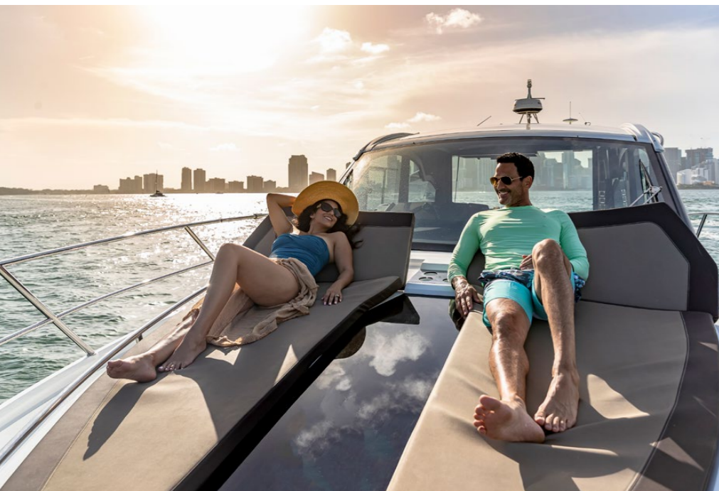
— Bow sundecks with back support