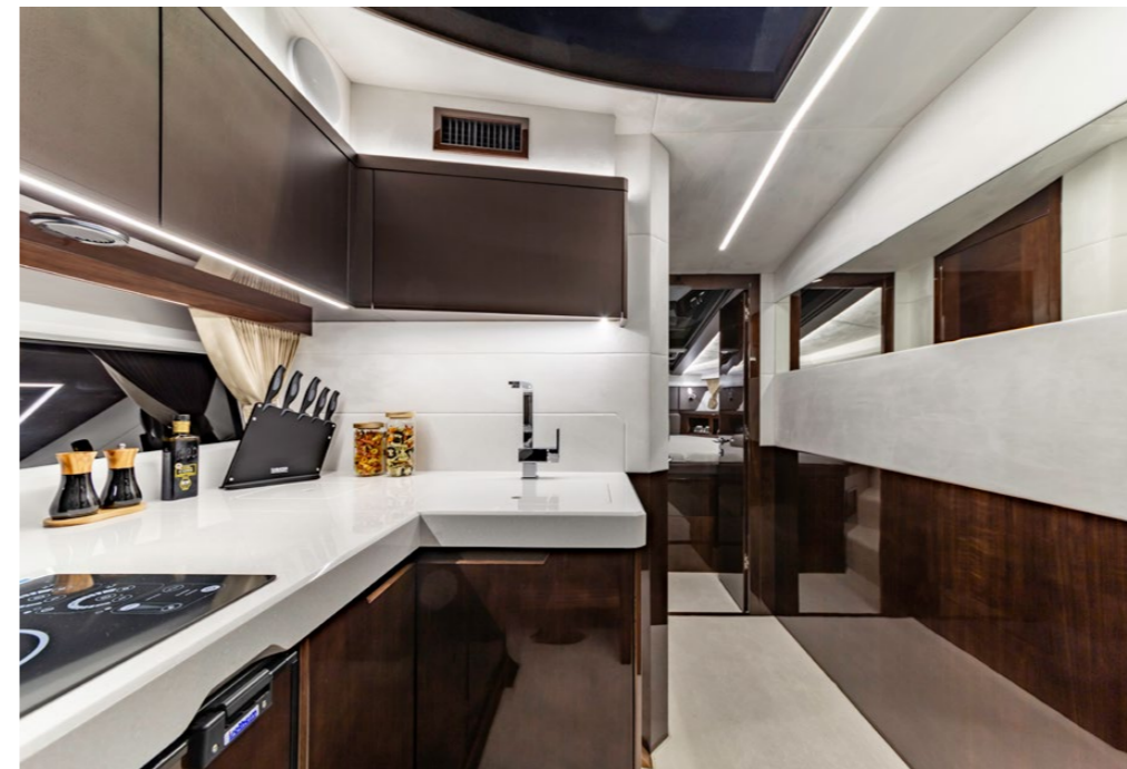
Luxury finish down below