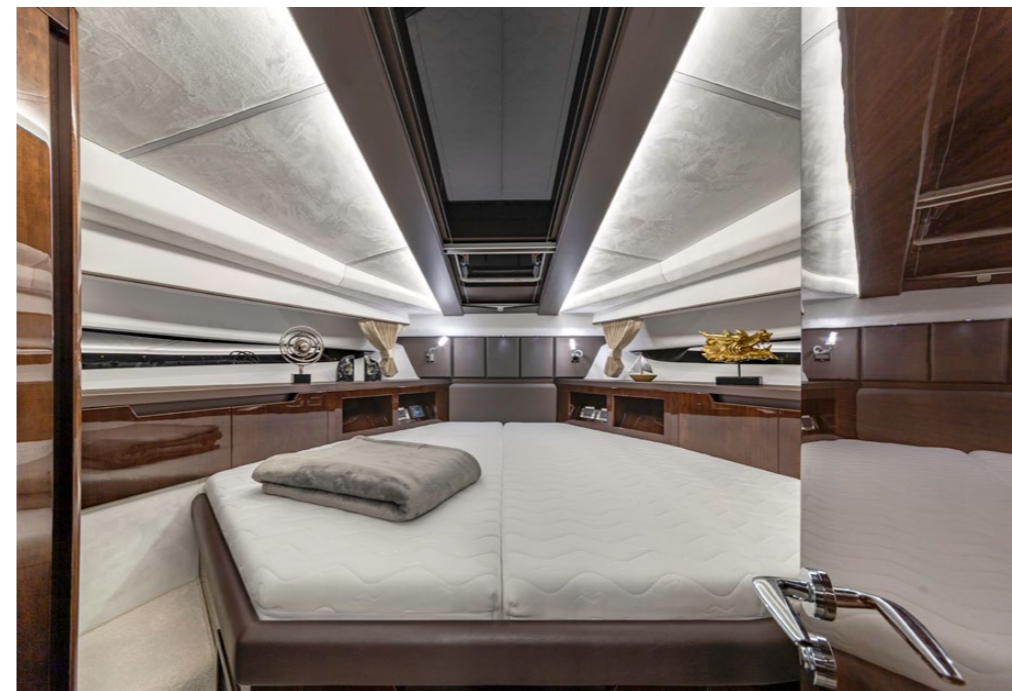
Bow VIP cabin with skylights