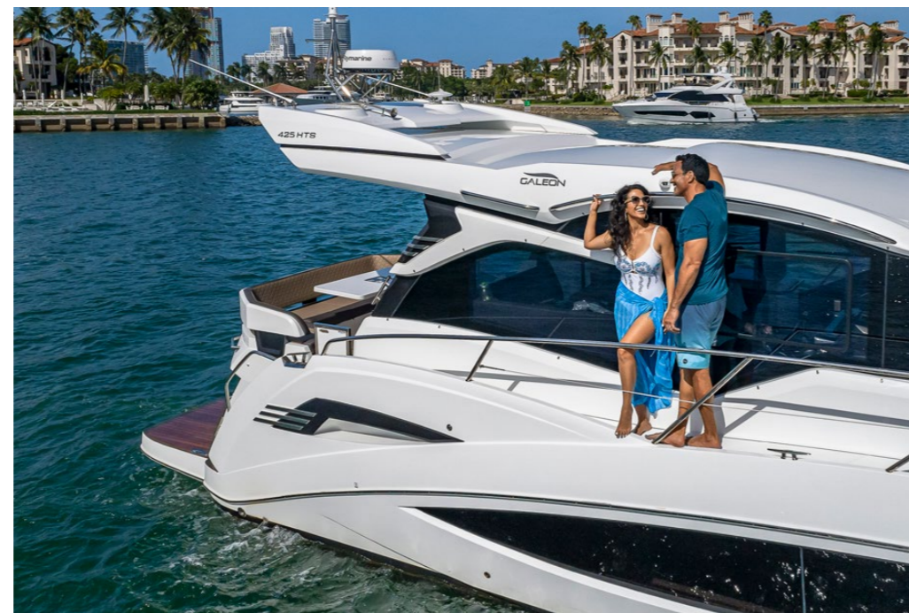
— Sporty touches abound from every angle