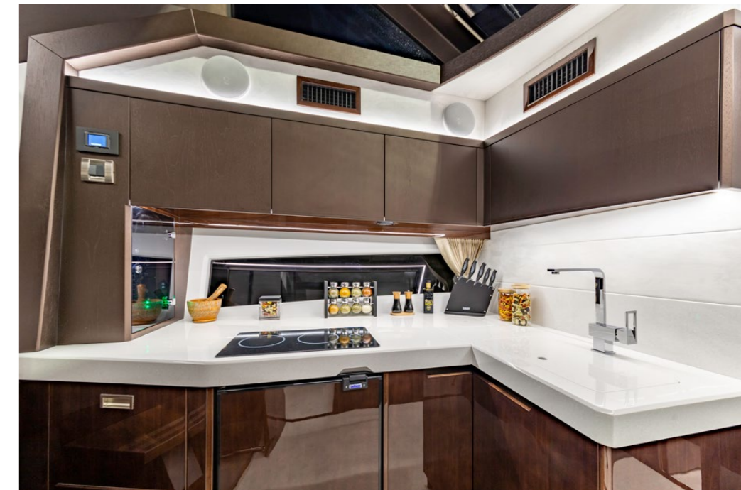
A well appointed galley area