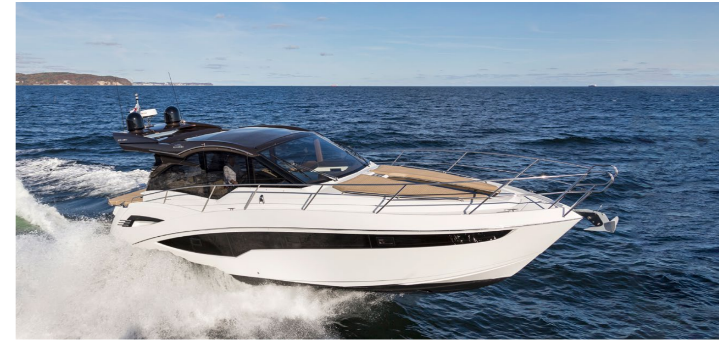
Two-tone colorway adds flair to an already striking design

The sport cruiser lineup was designed with performance in mind