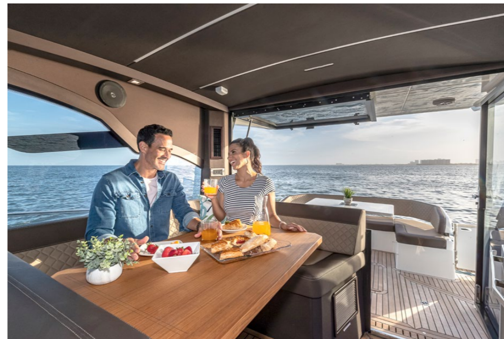
— All fresco dining at its finest