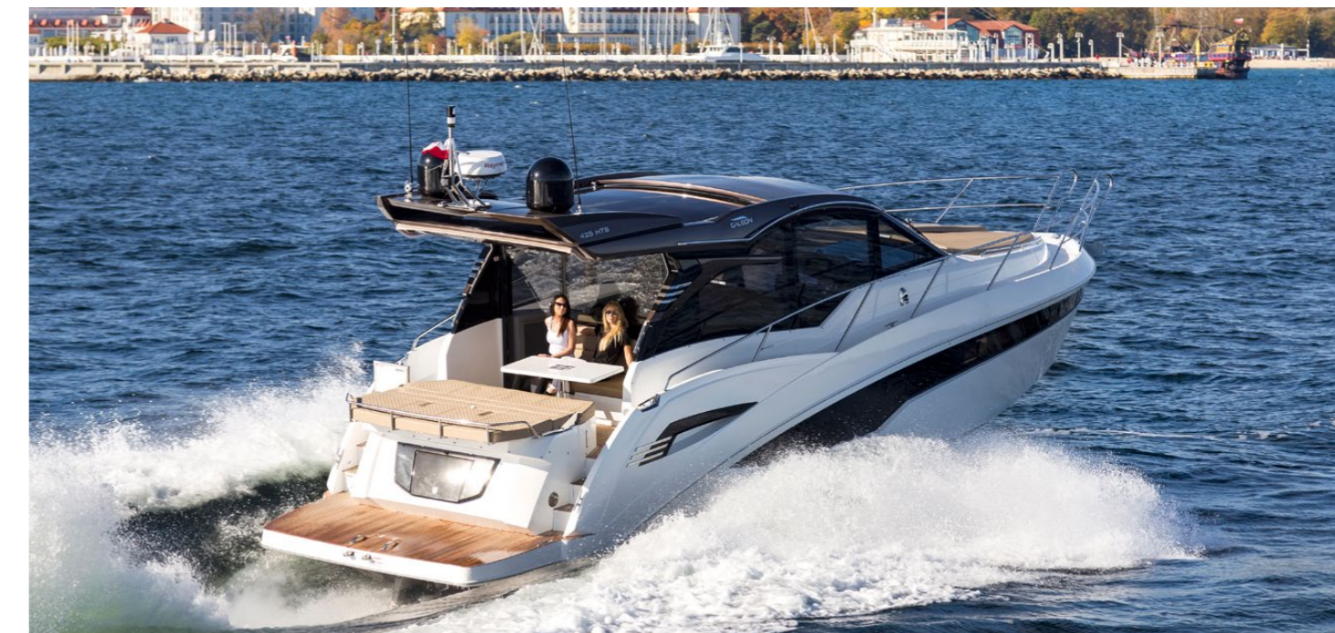
Sunpad morphs into cockpit seating