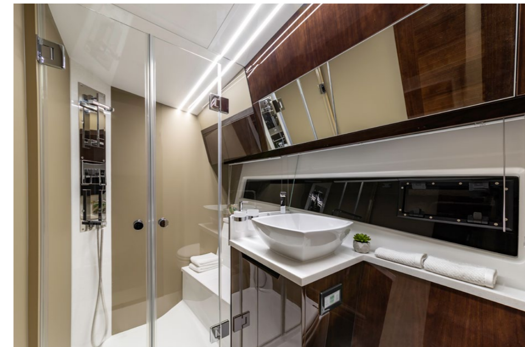
Spacious bathroom with separate shower cabin