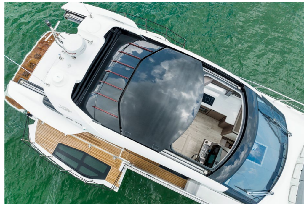
— Retractable sunroof is a definite highlight of the 450 HTC