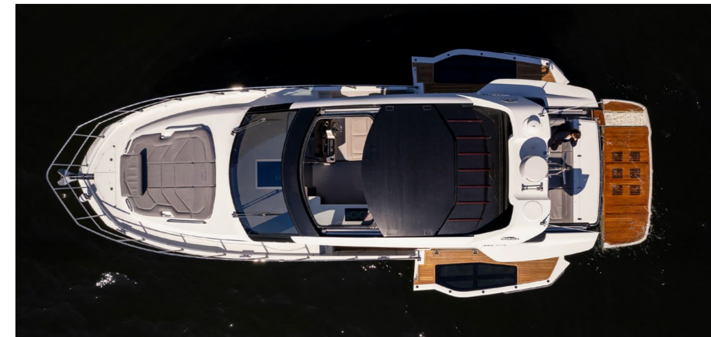
Retractable awning over the cockpit shades the area —