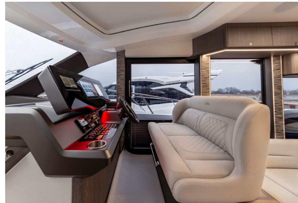
Double seat and sliding doors at the helm