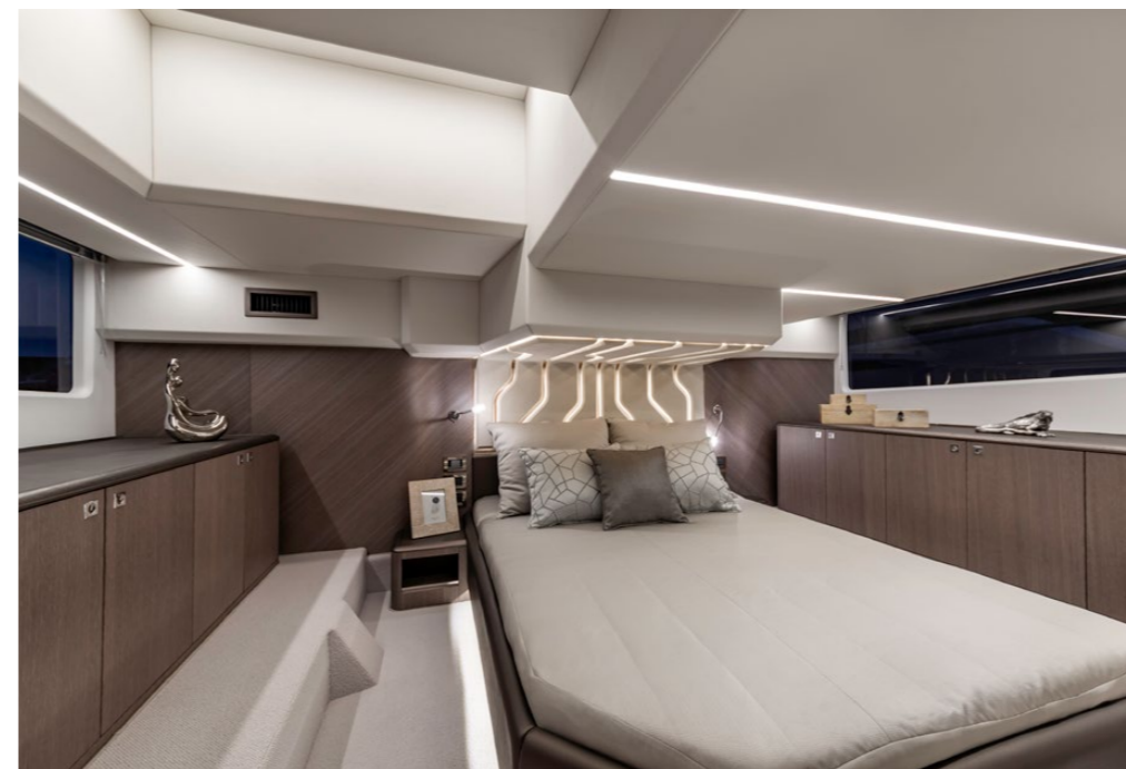
Midship owner's cabin stretches the whole beam of the yacht