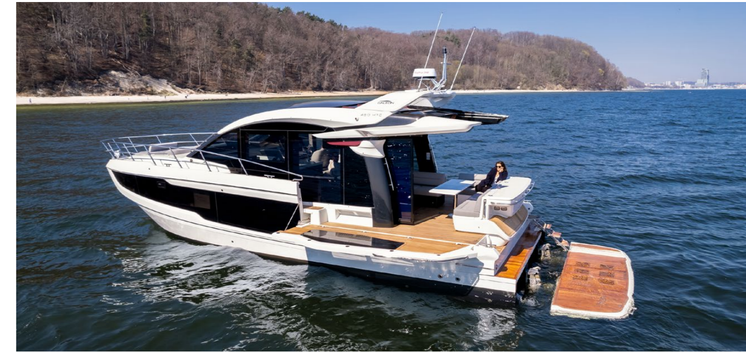
Engage Beach Mode and lower the platform for easy access to the water —

The striking exterior is highlighted by a full-length glass roof brightening the interior