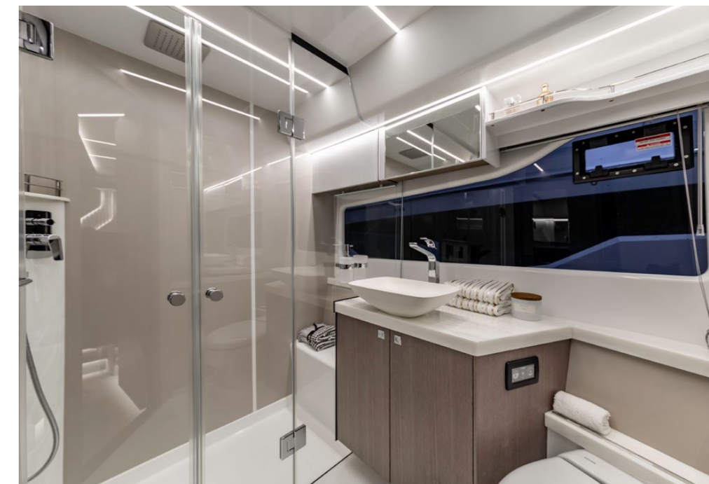
Separated head and shower for extra comfort