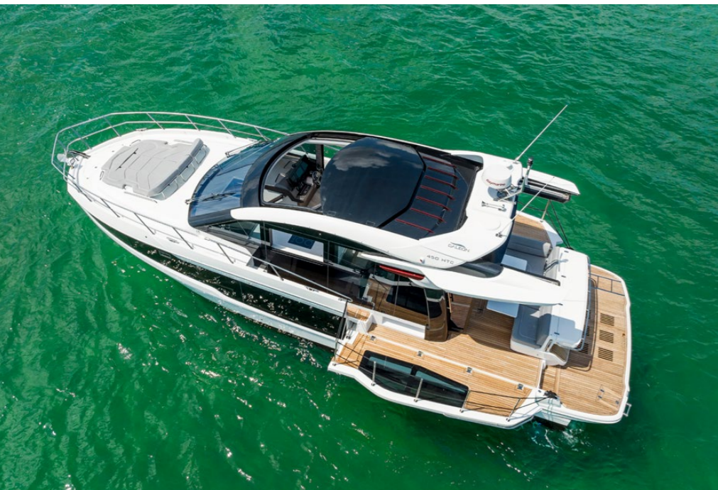
— With Beach Mode opened, guests will find plenty of space