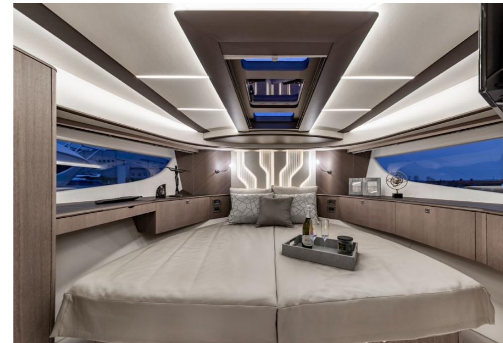
Bow VIP cabin is bright and inviting