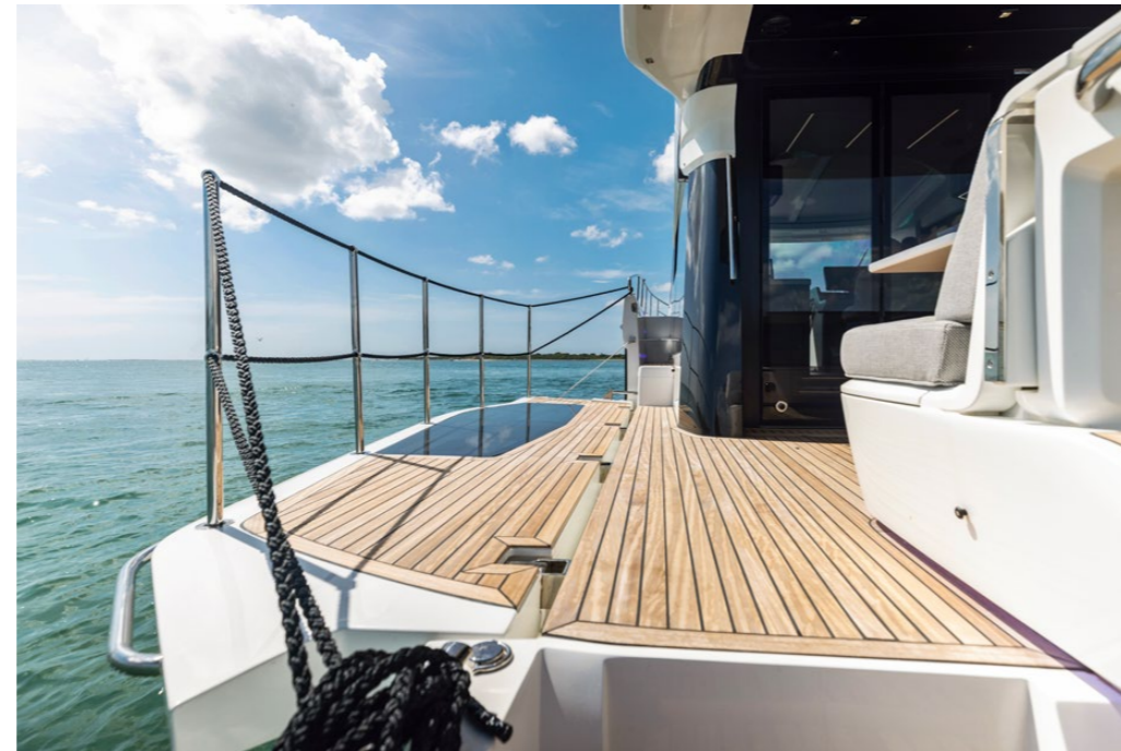
— Glazed balconies liven the outside during mooring