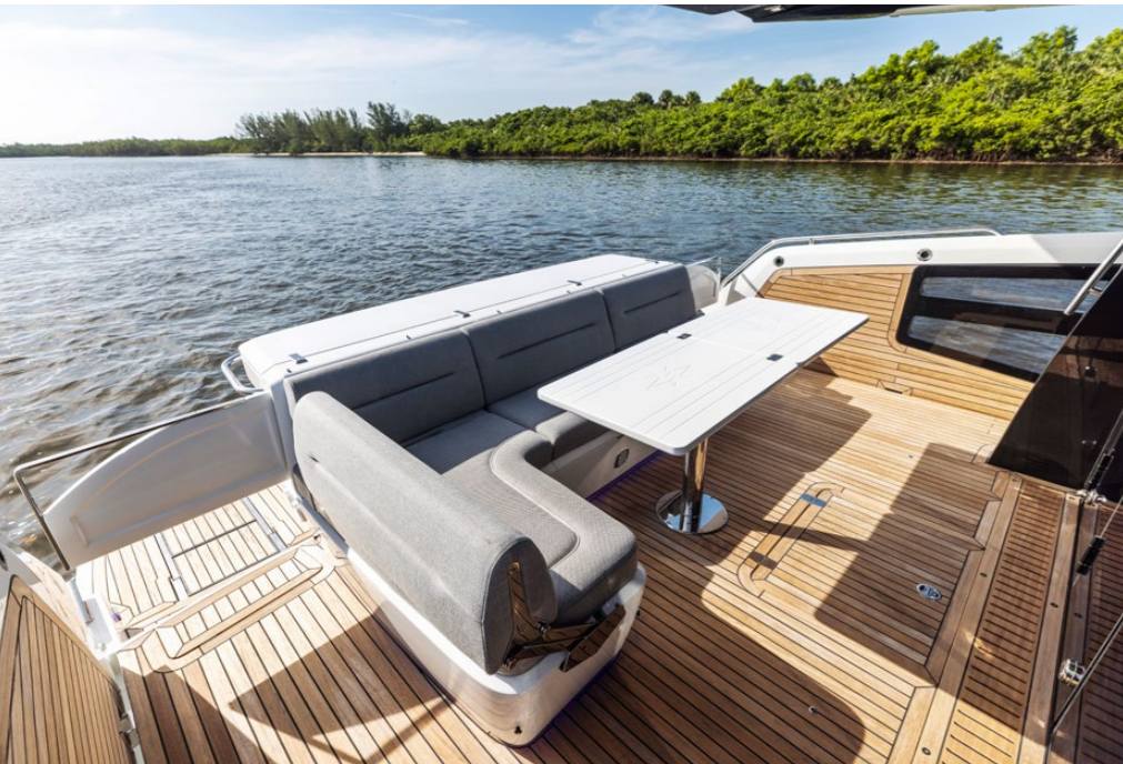
— Ample cockpit space for dining