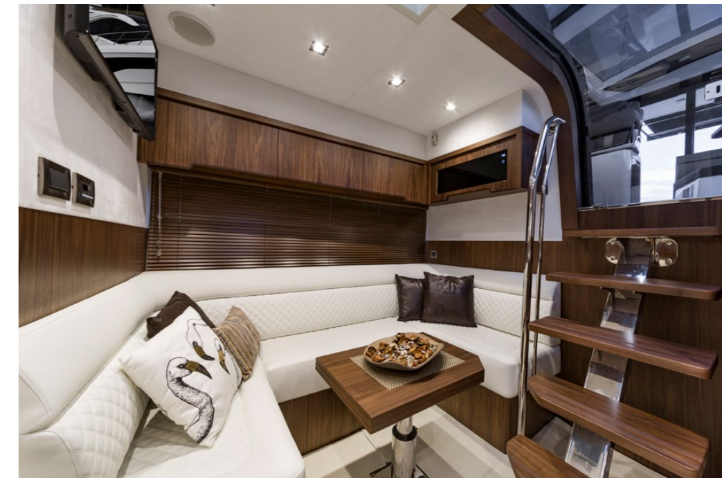
A dinette with a fold out table