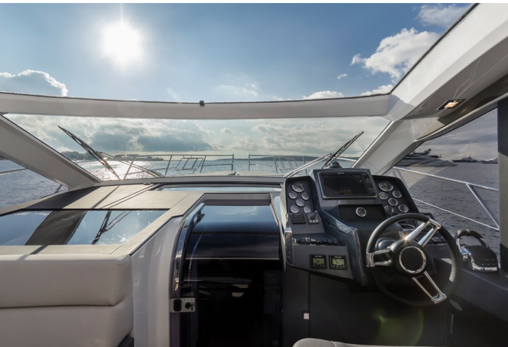
— Great visibility all around from the helm