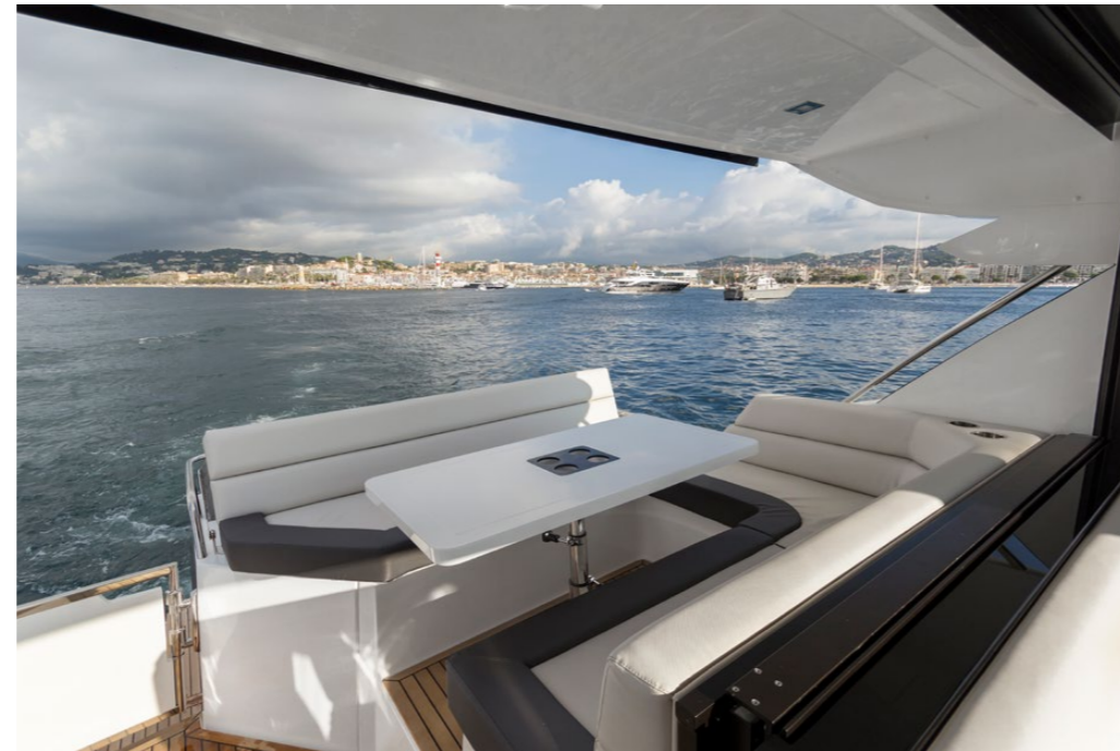
— Ample seating space in the cockpit