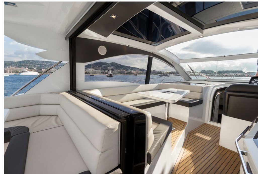
— A drop-down window separates the cockpit area