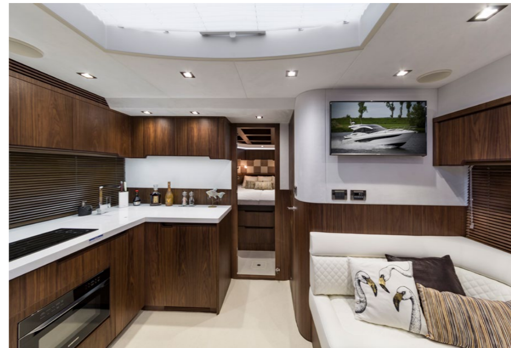
Bespoke interior available with custom design choices