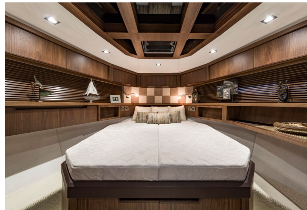
Forward VIP cabin with skylights above