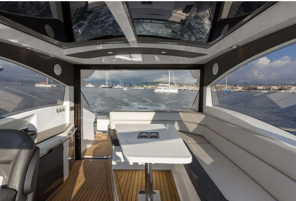
— The wet galley is perfect for serving refreshments