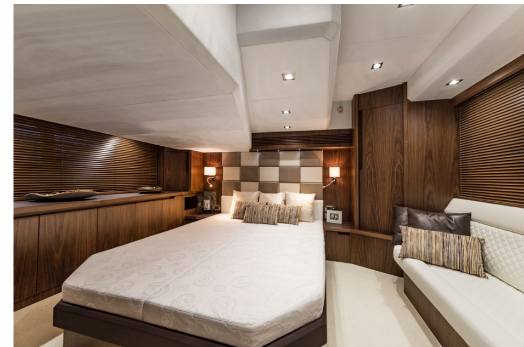
Midship owner's cabin with a rest area