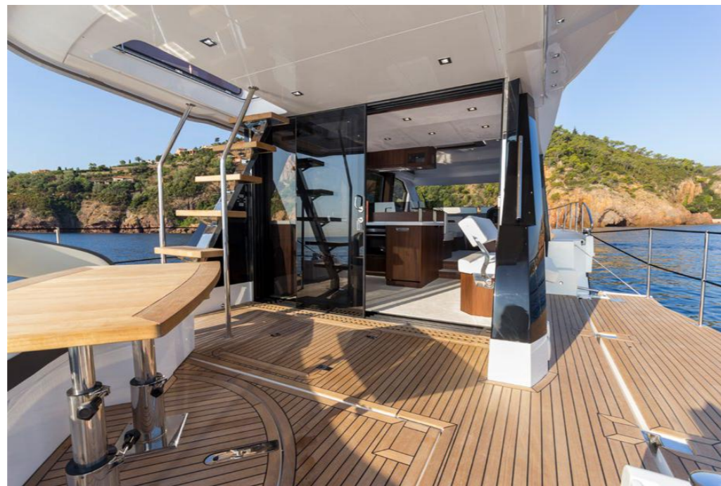
— Incredible cockpit area with the balconies down