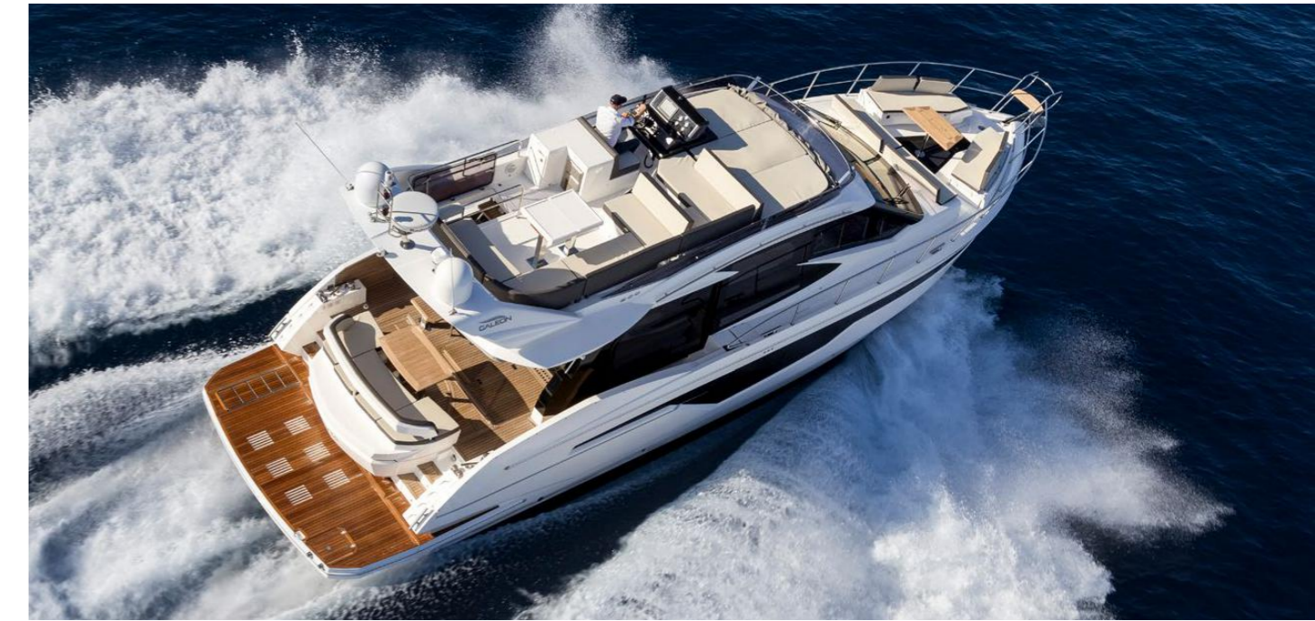
The roto-seat option allows the cockpit seating to face any direction —

Beach Mode extends the beam to six meters - serve refreshments at the bar