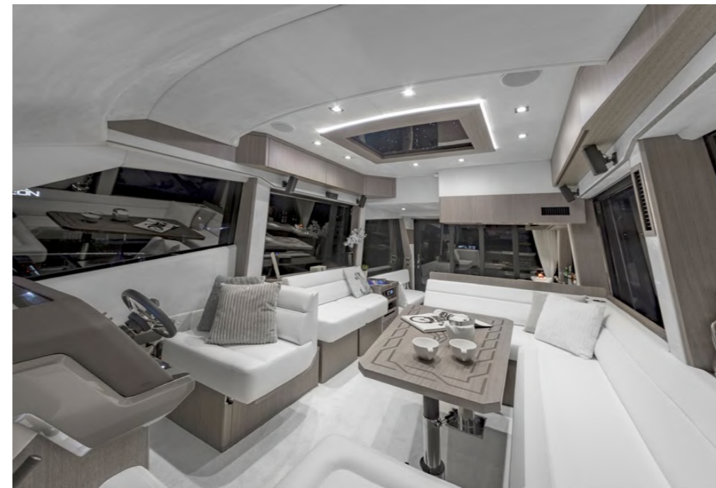
Dining and entertainment area with a pop-up TV