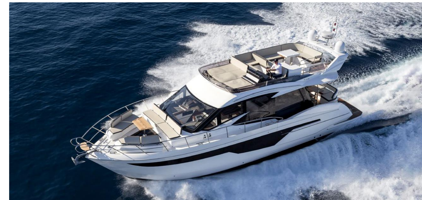
A large flybridge will fit all guests in comfort —