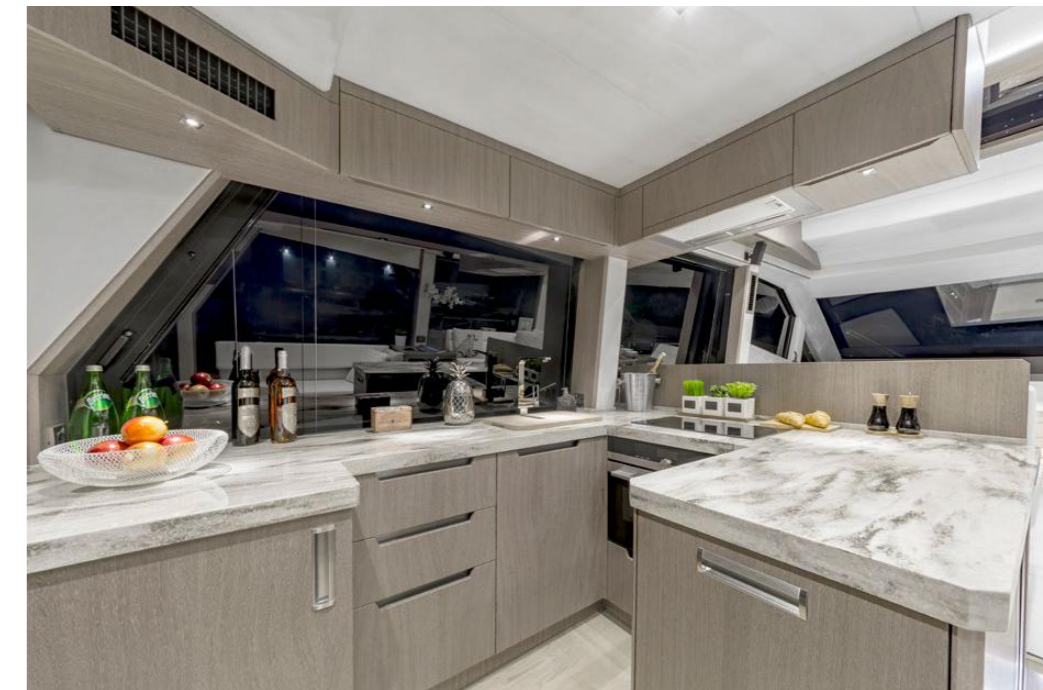
The kitchen comes fully equipped and can serve the outside bar