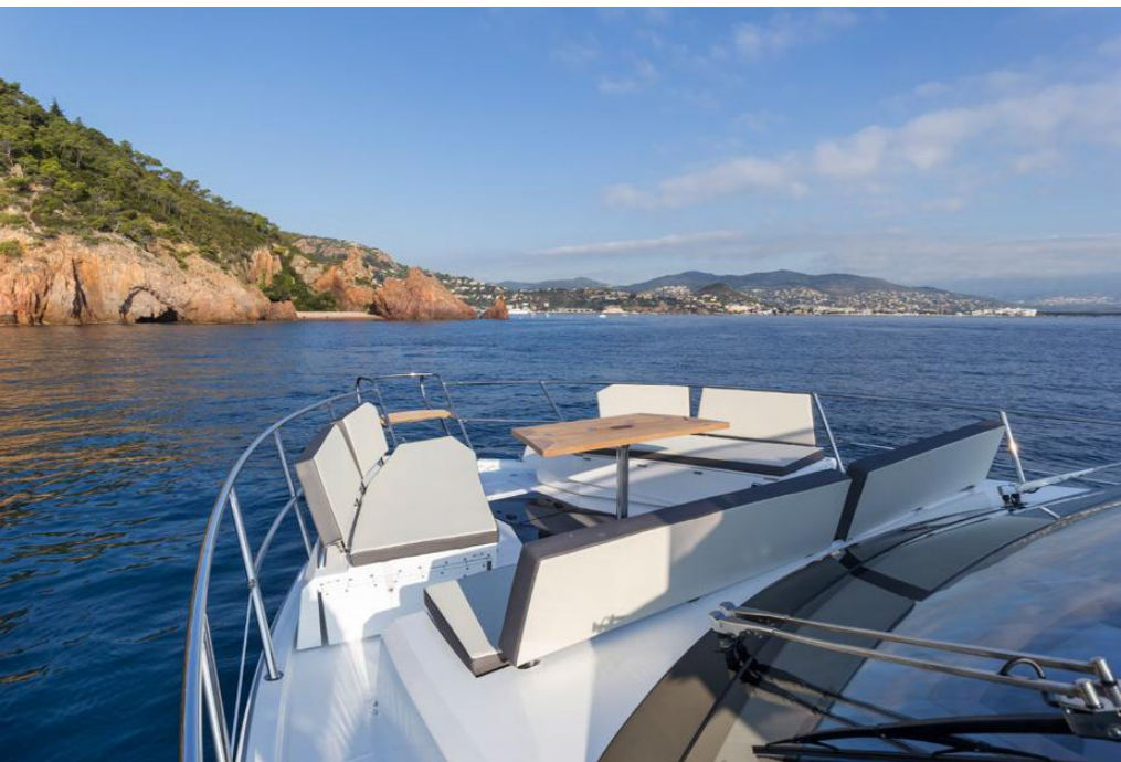
— Quickly drop the back rests and stow away the table for cruising