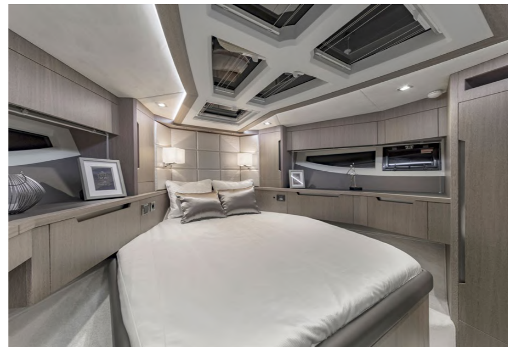
The bright VIP cabin offers ample storage