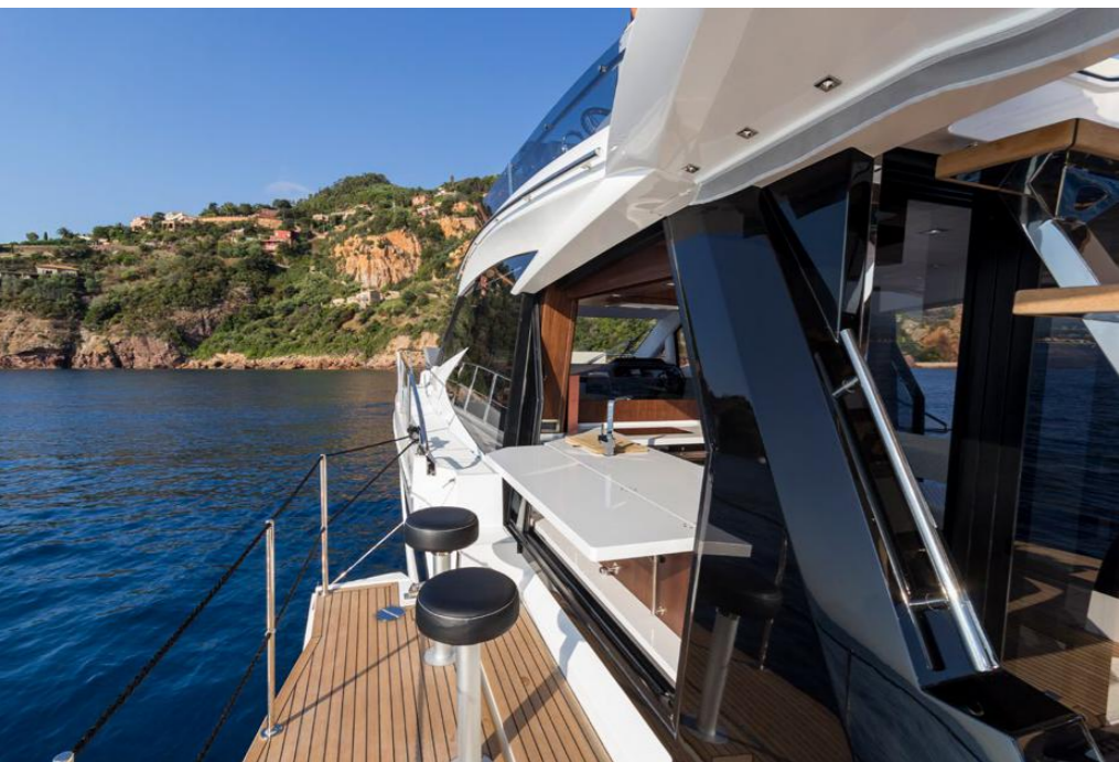
— Serve refreshments to the outside bar to impress the guests