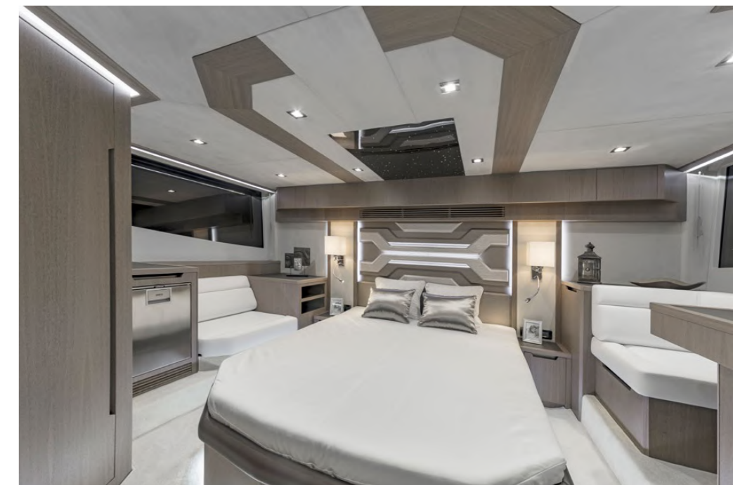
Master stateroom with en suite bathroom and rest area