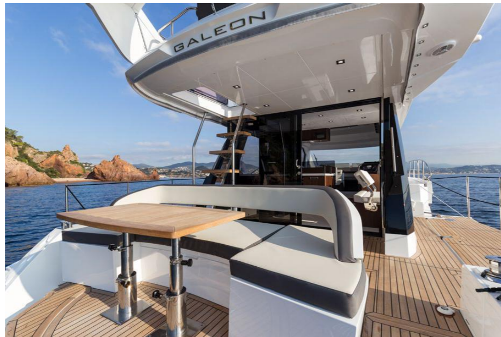
— The seat rotates 360°