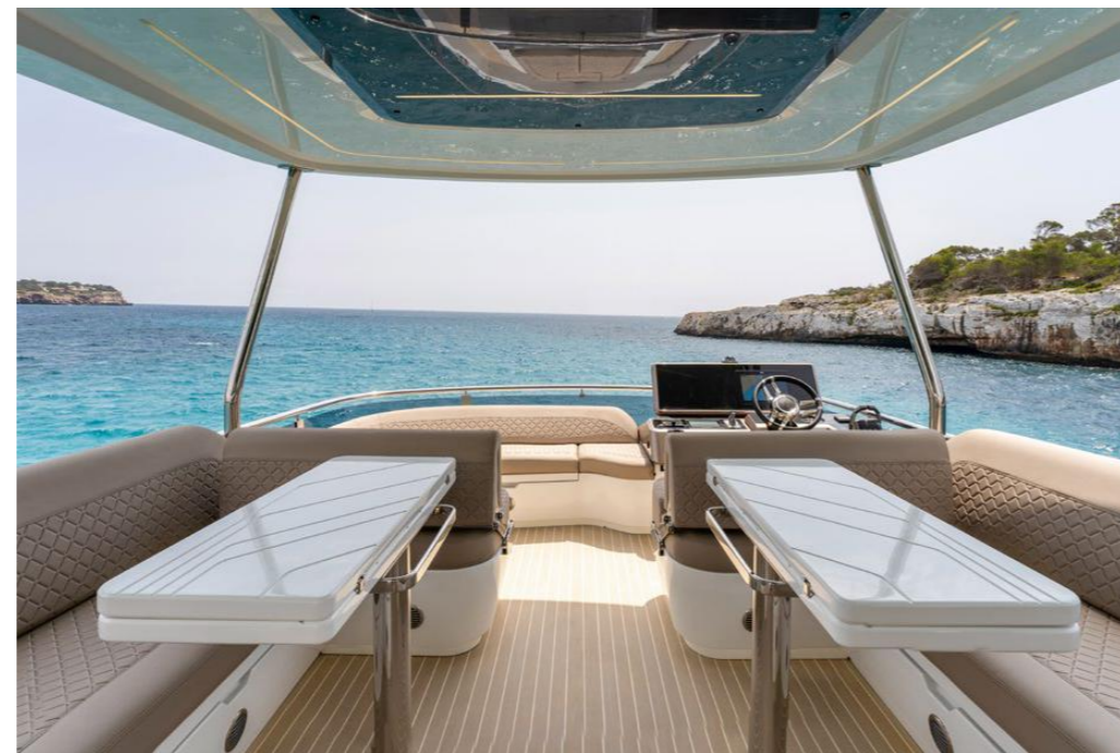
— Both tables link for a perfect al fresco dining experience