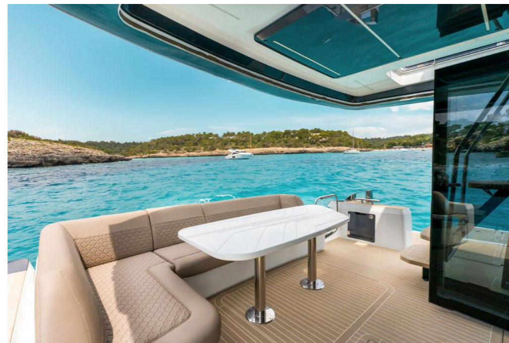
— Cockpit seating connects to the interior via sliding glass doors