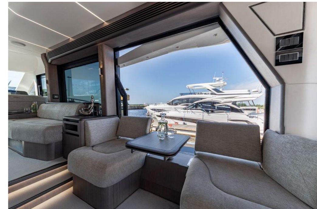
The side window effortlessly glides open —