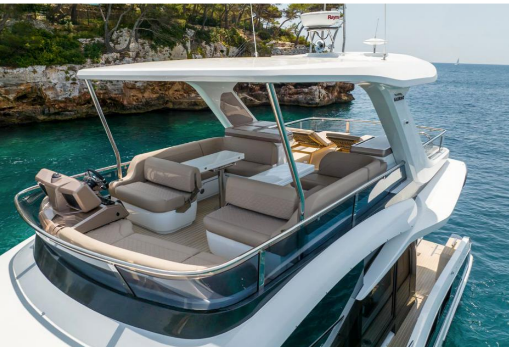
— The top deck is protected by a carbon roof