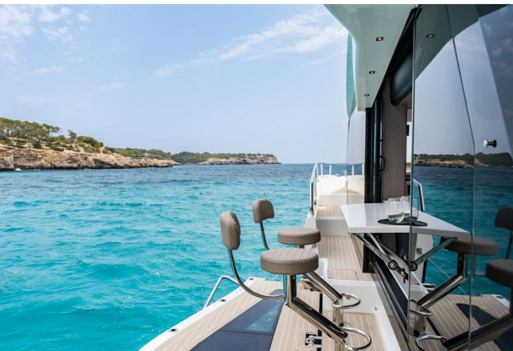
— Swiftly extend the cockpit to 6,82m with the Beach Mode