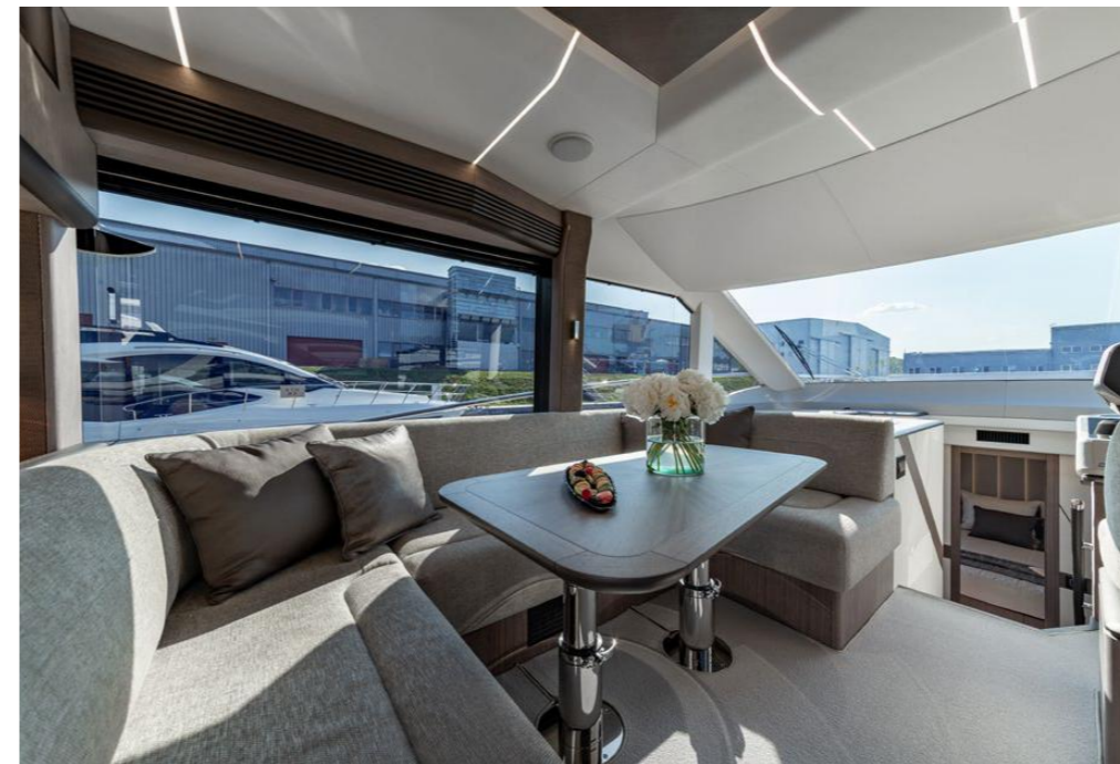
The dining area can be turned into an extra berth —