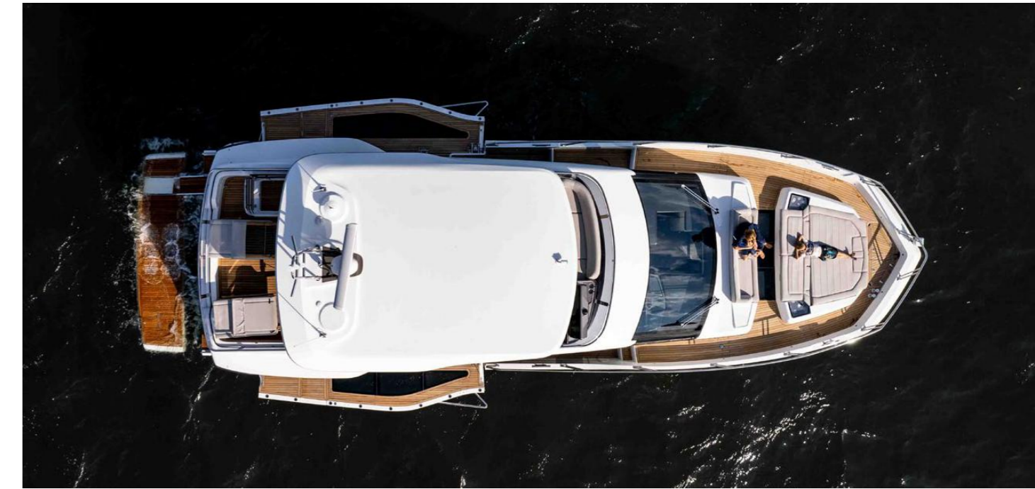
The carbon bimini is light and protects the top deck from the elements

Introducing the captivating new design of the 560 FLY