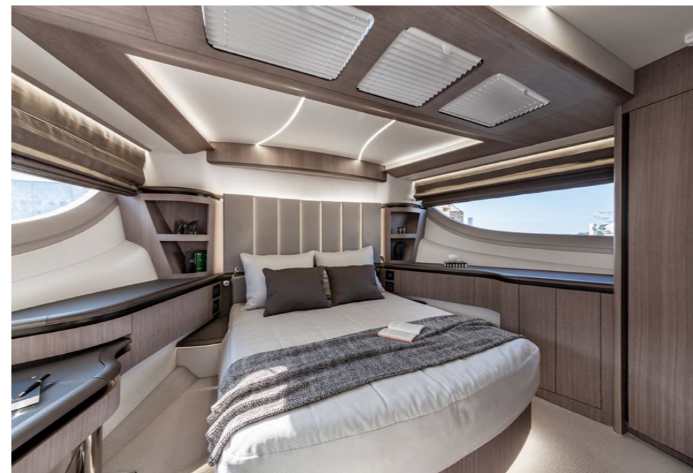
VIP Suite: abundant windows for breathtaking views —