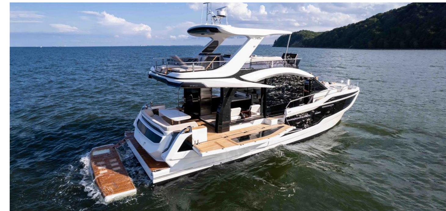
The 560 FLY is ready to host any party with the Beach Mode engaged