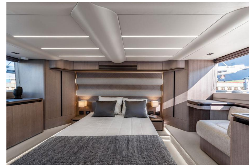
Owner's cabin occupies the whole beam —